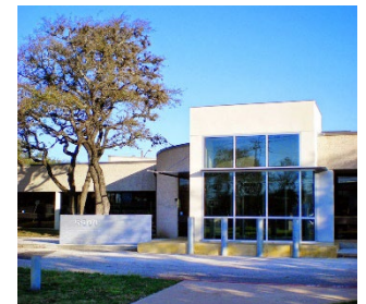
Cepeda, Ruiz, and Menchaca Libraries