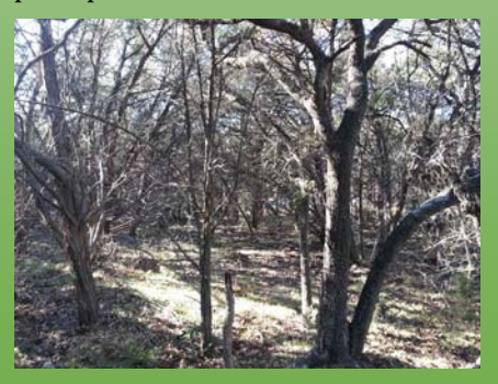
Before shaded fuel break treatment

Fulfilling their goal of becoming a Firewise Community didn't stop Jester Estates from continuing to protect their community against the threat of wildfire. In January of 2014, homeowners partnered with the Austin Fire Department and the Water Quality Protection Division of the Austin Water Utility to create a shaded fuel break within critical areas of ingress and egress along the border of Jester Estates and the Balcones Canyonlands Preserve. Over 2,200 linear feet of wildland was treated and a demonstration plot created to raise awareness of the importance of fire-adapted principles.