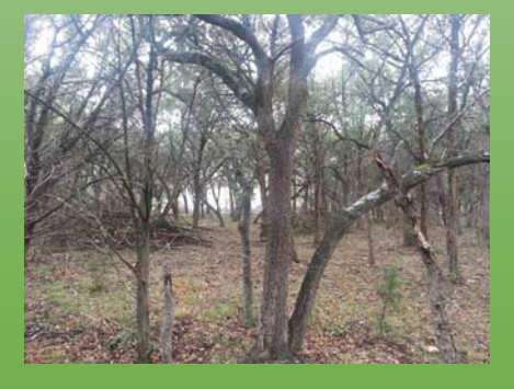
After shaded fuel break treatment