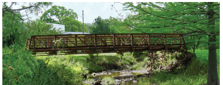
These images are examples from other project sites of the kinds of improvements that will be made at Battle Bend Neighborhood Park.