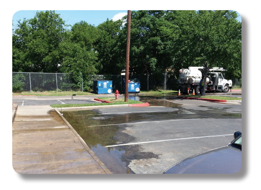
Sewage overflows are a threat to human health and can negatively impact to the value of your property.