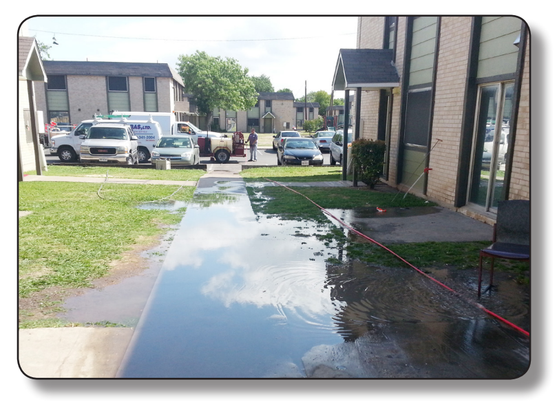
Sewage overflow at an Austin apartment complex.

Austin Water will attempt to assist you with the sewage overflow issue. However, our actions to stop the overflow may not correct the problem. Sewage overflows are often the result of old or defective private plumbing which can include broken pipes, blockages caused by grease and other materials. When this happens, customers are required to obtain a plumbing permit and repair or replace their private wastewater line. For information regarding permitting requirements and financial assistance options, contact the Private Lateral Program at 512-972-0069.