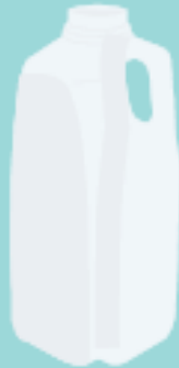
PLASTICS #1 & #2