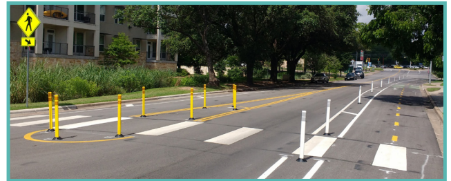
Pedestrian crossing island built with flex posts