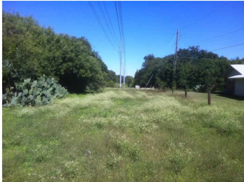
Electric power ROW looking north from Ventura.