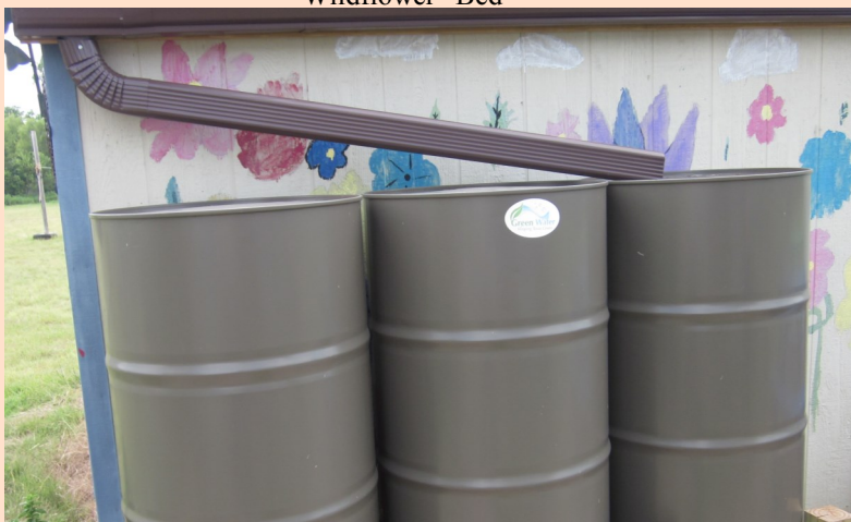
Rainwater Collecting Barrels