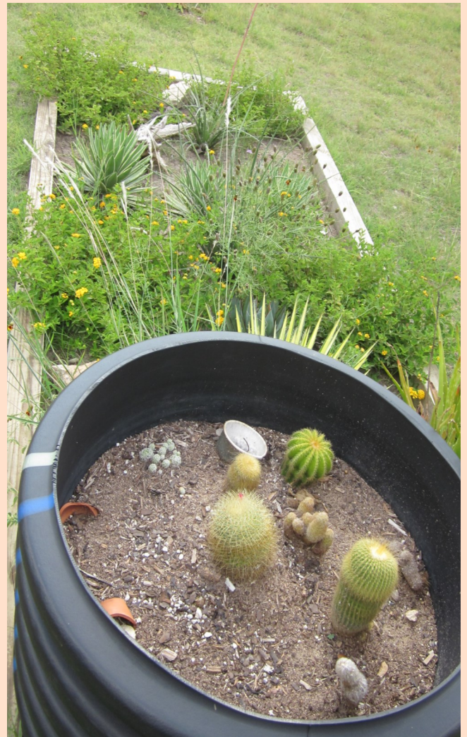
Mini Succulent Garden