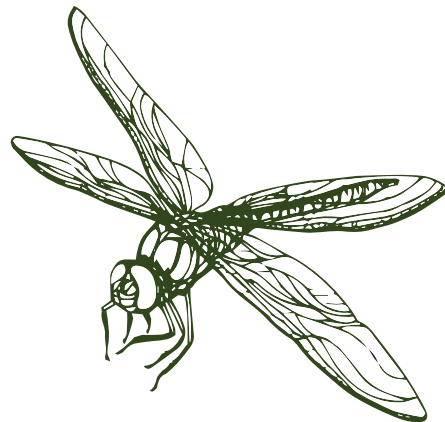
GREEN DARNER DRAGONFLY