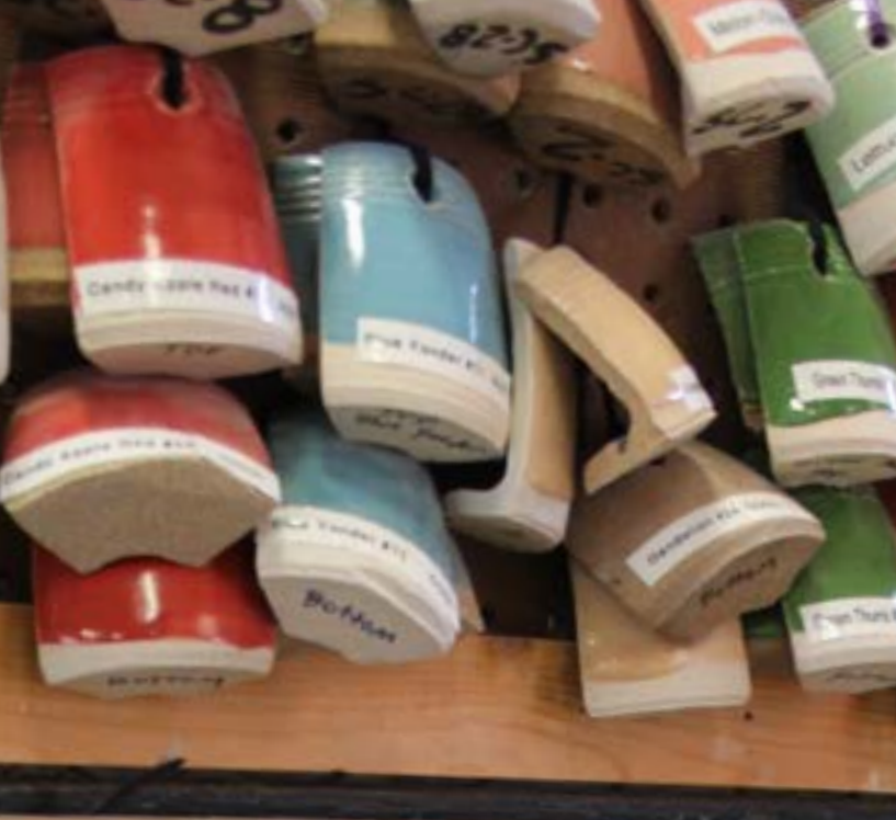
Cone 10 glazes created at DA These glazes are created by DAC Studio T