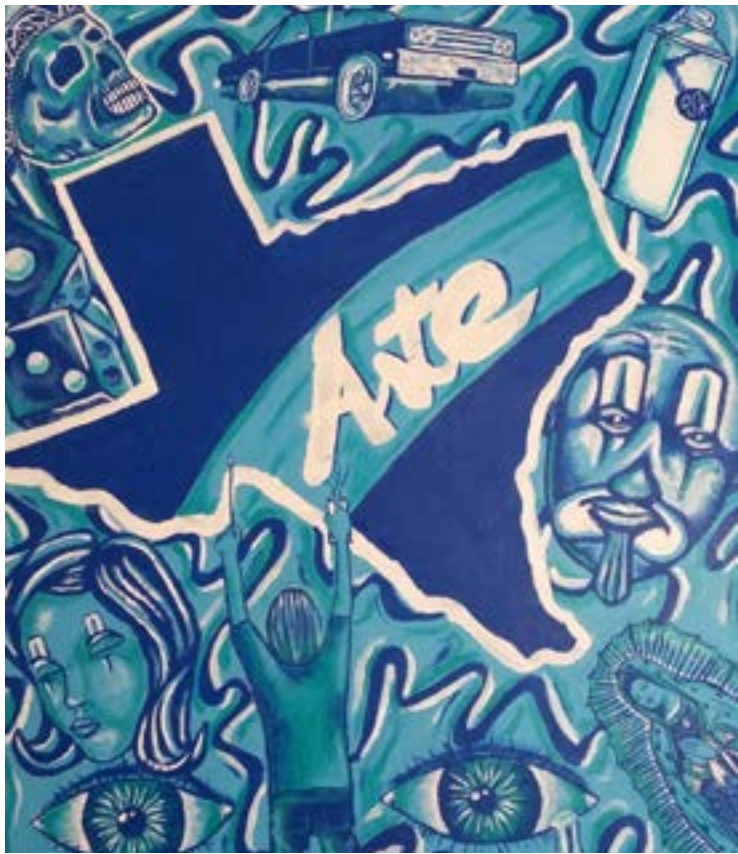
Arte Texas La Lucha Siegue July 13 – August 7

Arte Texas is a local group of East Austin artists with deep roots saving Austin's neighborhood murals. La Lucha Siegue will feature original cultura and new age art work, including paintings, sculpture, photography, works on paper, and multimedia.