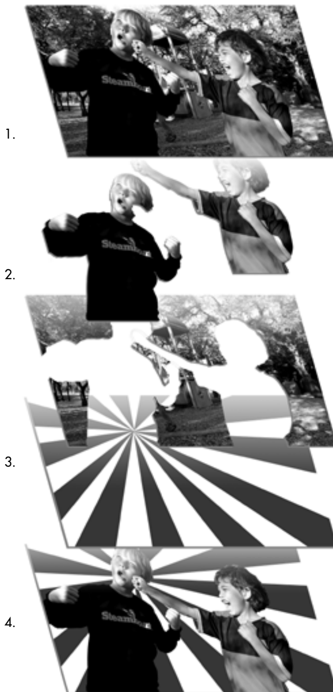
Working in ADOBE PHOTOSHOP Layers