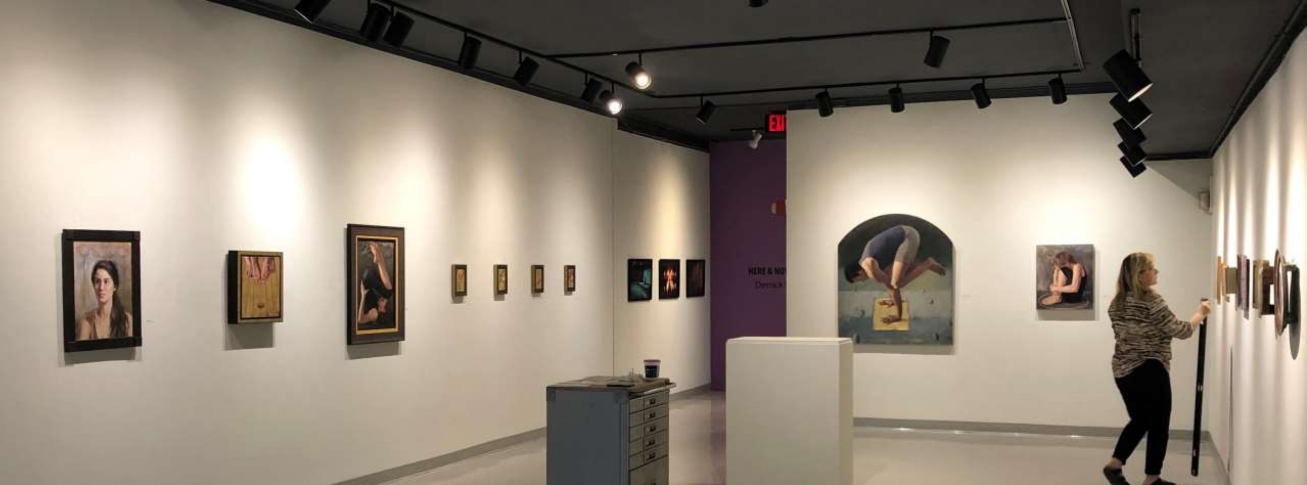
The Julia C. Butridge Gallery at the Dougherty Arts Center