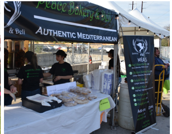
AsianEats Night Market