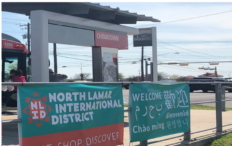
International District MetroRapid Banners