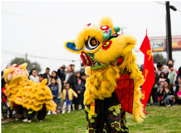
Chinatown Center Lunar New Year