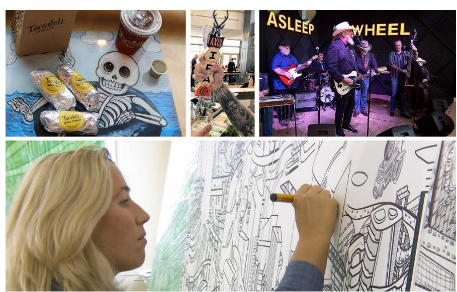
2019 Airport Fun Facts - Keeping It Local

Austin-Bergstrom International Airport (AUS®), is the airport of choice for Central Texas, flying to over 63 destinations with 17 carriers. Currently experiencing an almost 10% annual growth in PAX, it is the 2<sup>nd</sup> fastest growing airport in the U.S. AUS® is owned and operated by the City of Austin, through its Department of Aviation.