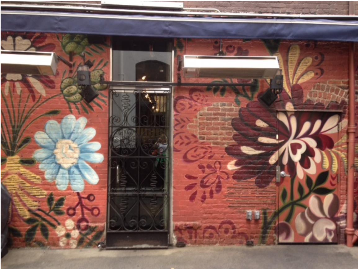
San Francisco Alley.

Additionally, and related to the last vision statement above, the revitalization of Austin alleyways supports the Downtown Austin Plan's goals of providing for new cultural facilities and live music venues, incubator spaces for artists, rehearsal and performing spaces, and other creative culture uses and businesses. xxiii