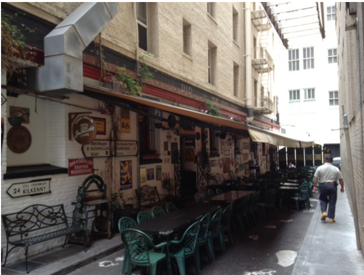
San Francisco Alley.