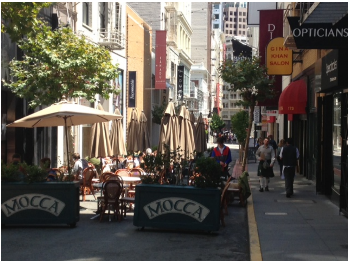
San Francisco Alley.

San Francisco: The City of San Francisco has made the preservation and activation of alleys a citywide priority, recognizing their important role in dense urban neighborhoods for creating human-scale space and pedestrian-oriented spaces, while breaking up the scale of large blocks and creating a more useable development pattern. xxx Dozens of alleys in the urban core have been renovated and transformed into spaces actively utilized by small businesses, retail, and dining/entertainment establishments. Belden Place in the financial district is one of the city’s most famous alleyways, with multiple restaurants and outdoor seating—the alley has become a magnet for residents and visitors. Some of the alleys are open for services during the early morning hours, and then closed to vehicular traffic during the day. Maiden alley, for example, has two beautiful white gates at end of the alley, which are used to close off the alley to vehicles starting in the late morning, when the alley is transformed into a shopping esplanade with high end boutique stores. New alleys are also being included in new development to break up super blocks and provide opportunities for small business opportunities and enlivened public spaces, and the City has developed height limits and step backs along alleys to allow light and air to circulate. The City’s general plan bans the selling off of alleys, and the city routinely incorporates the makeover of alleys in its public works projects.