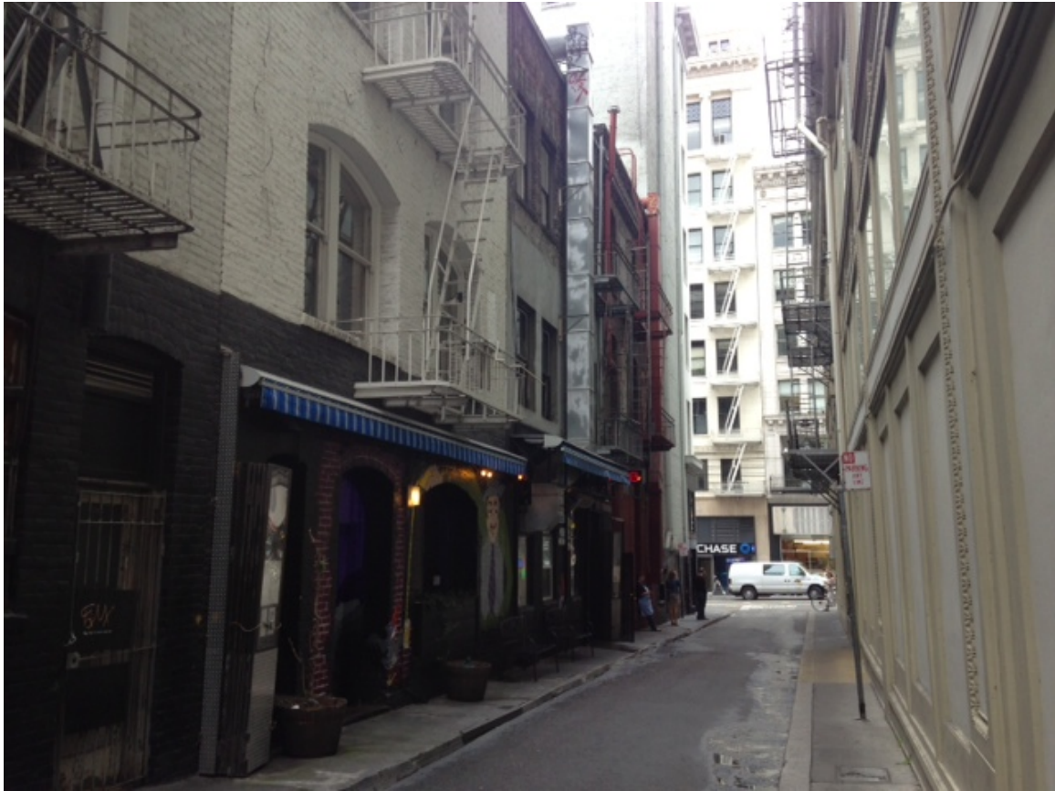
Seville, Spain Alley.

engaging lighting. Others may need more extensive improvement to allow for both utilitarian and social uses.