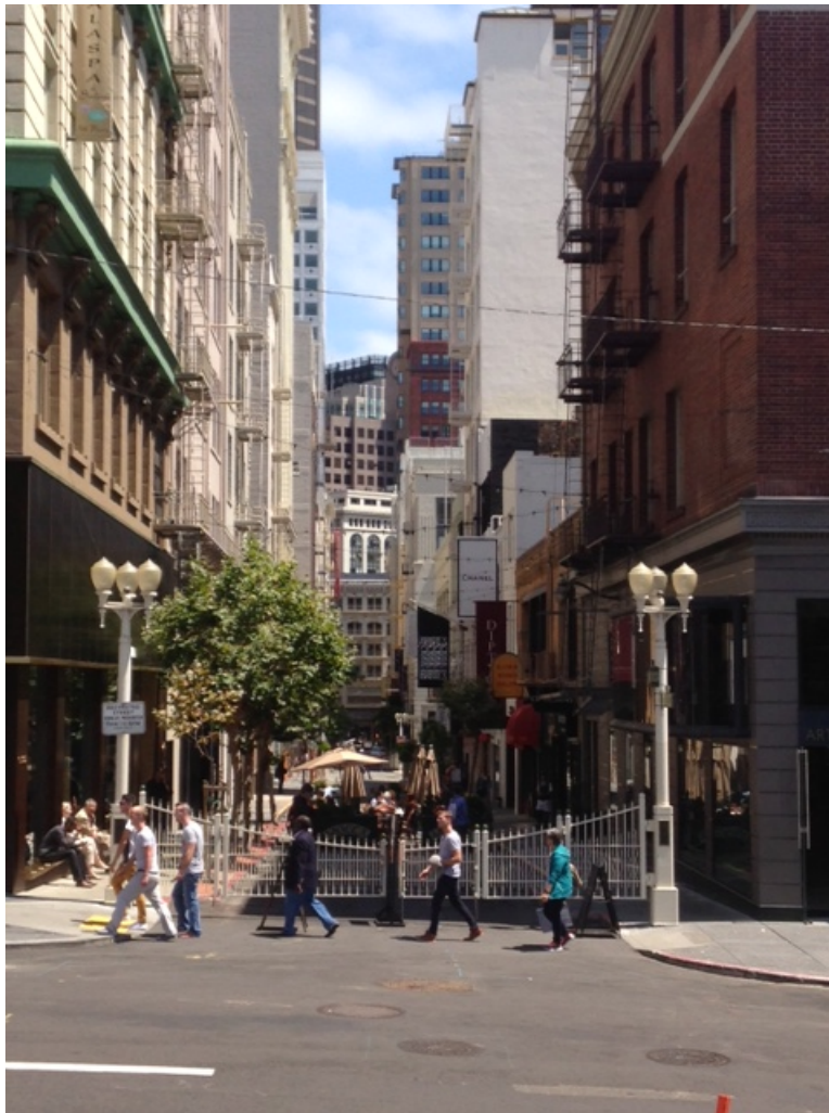
San Francisco Alley.