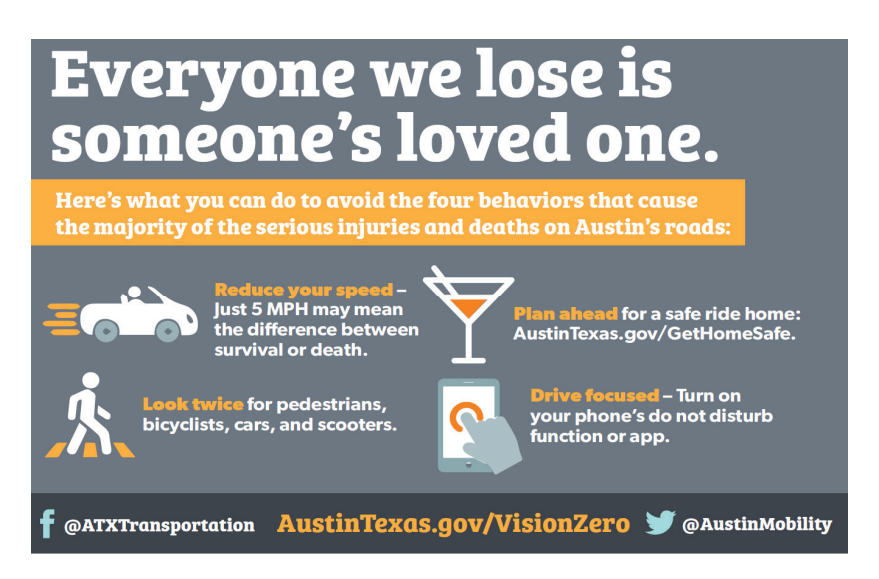
Exhibit 4: Example of a recent ATD effort to address dangerous driving behaviors