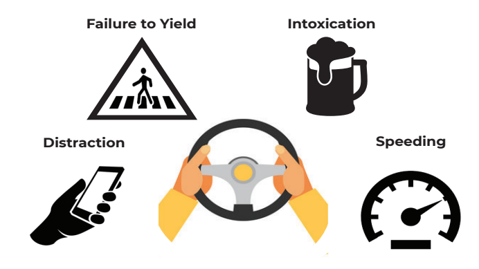
Exhibit 3: Four Dangerous Behaviors are Frequently Cited as Causes of Crashes in Austin