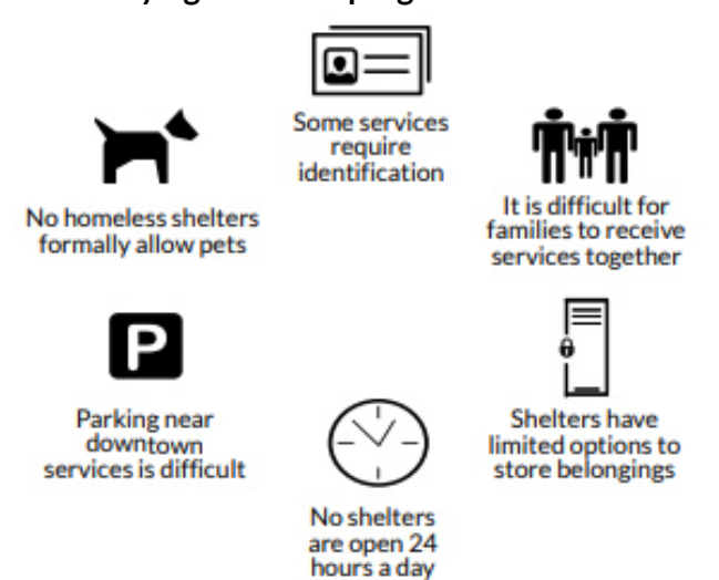
Exhibit 4: A person experiencing homelessness may face barriers when trying to access programs and services

The City is pursuing some efforts towards reducing barriers, such as researching how emerging technology can help people maintain important records.