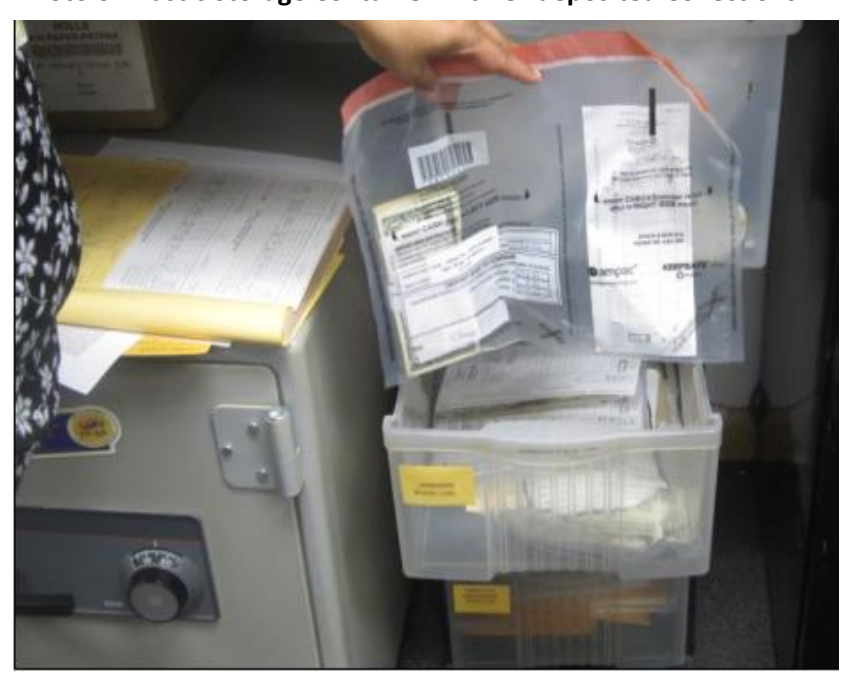
EXHIBIT 1 Photo of Plastic Storage Container with Undeposited Collections

EMS employees responsible for cash handling store undeposited collections in sealed bags, which are then placed in an open and unattended plastic storage container in the department's Billing Office while awaiting pick-up by armored truck personnel (See Exhibit 1). Billing employees have easy access to the undeposited funds, which provides an opportunity for theft. Other EMS employees, besides Billing Office employees who enter the Billing Office, can also access undeposited collections in the open and unattended plastic storage container. Auditors performing a walk-through of the Billing Office found $208,128 undeposited in the open container, including $679 in cash. On another day, auditors found cash of $801 in the open container.