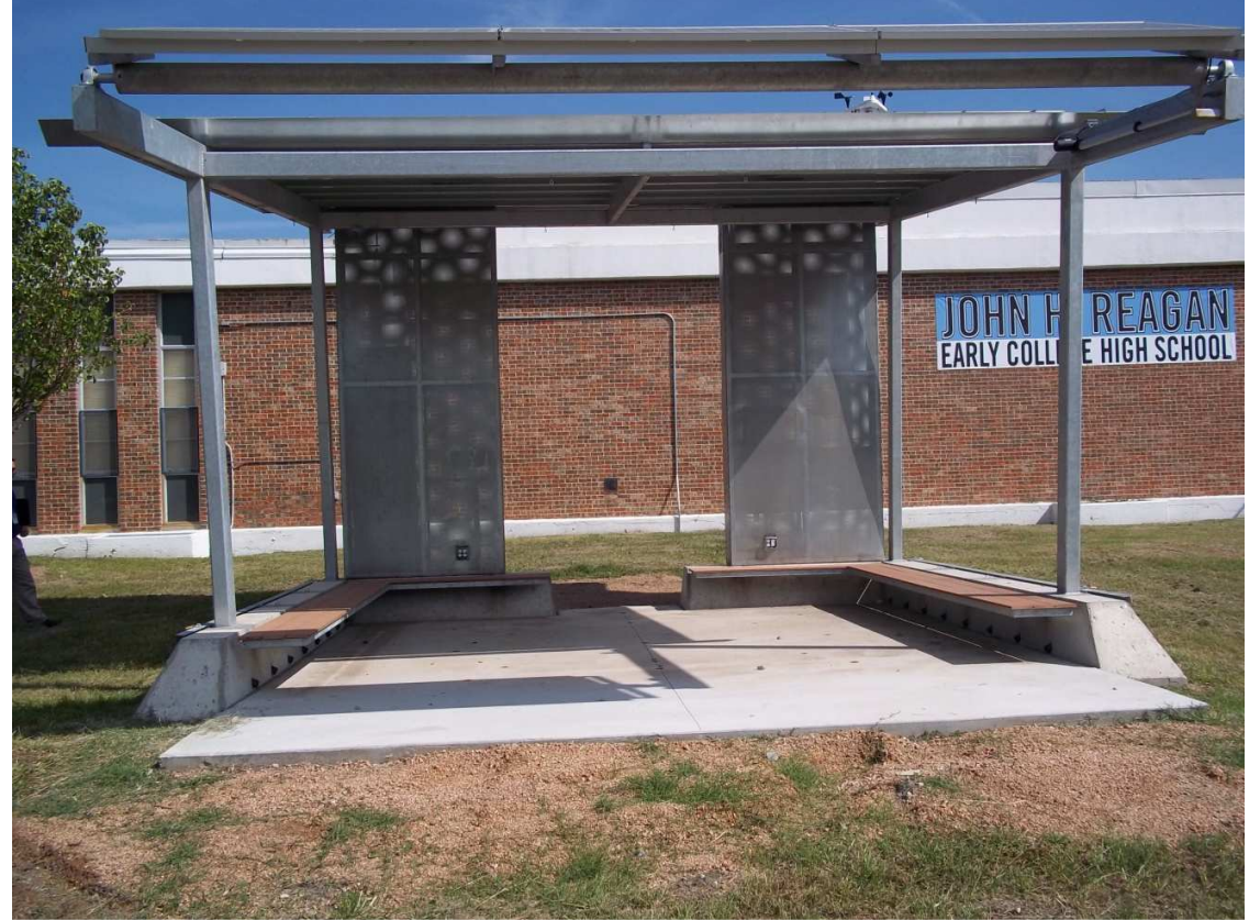
EXHIBIT 4 Reagan High School Solar Powered Outdoor Learning Center

OCA auditors confirmed that payments for the solar powered outdoor learning centers complied with contract terms and appropriate supporting documentation existed. Auditors also visited a sample of AISD campuses to confirm that installation of the learning centers was completed in compliance with the grant requirements. See Exhibit 4 for an example of one learning center.