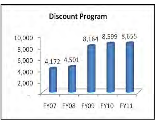
EXHIBIT 1 Discount Program and Plus 1 Program Households Served FY 07 to FY 11