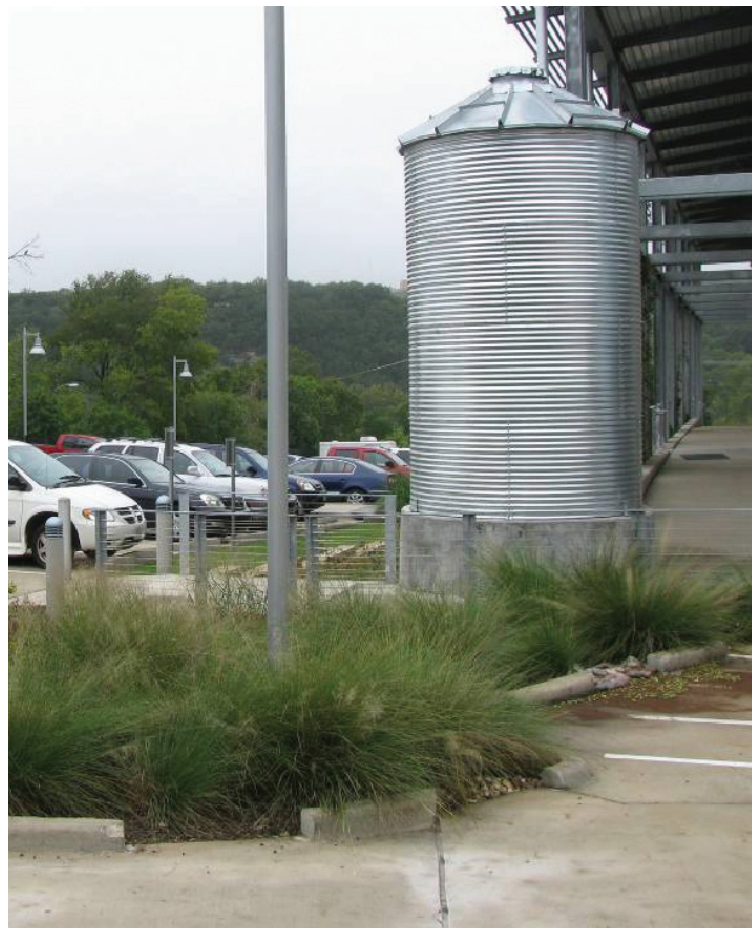
Landscapes may double as water quality controls if designed to City Criteria