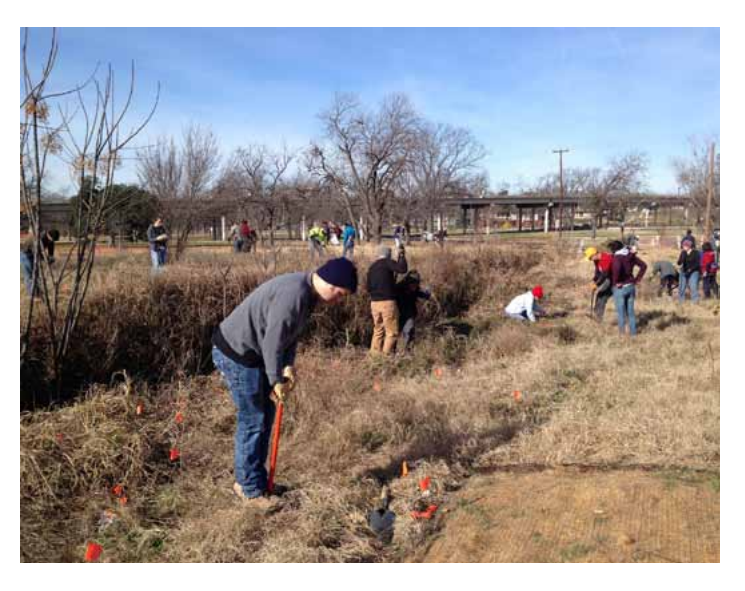
Volunteers plant trees around Boggy Creek

We've recently emerged from an exciting season of growing Austin's urban forest. Central Texas' tree