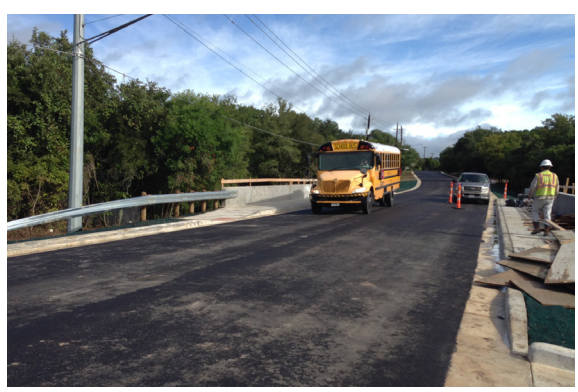
David Moore Drive before (left) and after (right) the project's completion

The objective of the project was to reconstruct the low-water crossing to meet current City standards, meaning that it must safely convey the 25-year storm and have no more than 6" overtopping the roadway during a 100-year storm. A precast concrete span and four concrete culverts were used to replace the three existing undersized culverts. For a lower initial cost, these modular concrete bridges require less material than cast-in-place structures and require very little maintenance. Installation is also faster than cast-in-place structures, which minimizes road closings and detours. To improve the overall safety of David Moore Drive, the crossing was also upgraded with new sidewalk and safety railing. Construction was completed in 2014.