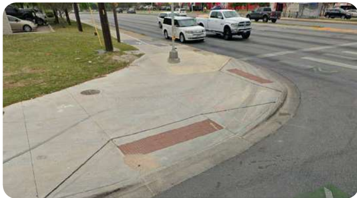
East Slaughter Lane at South First Street

Americans with Disabilities Act (ADA) compliant curb ramps have maximum slope thresholds and tactile detection for vision-impaired pedestrians.