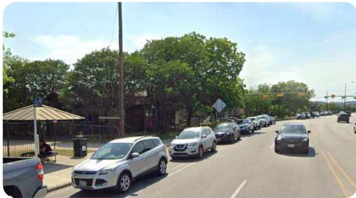
Eastbound Lake Austin Boulevard at Veterans Drive

Relocating the bus stop pair at Upson Street will improve transit rider access to a safe crossing and improve bus operations.