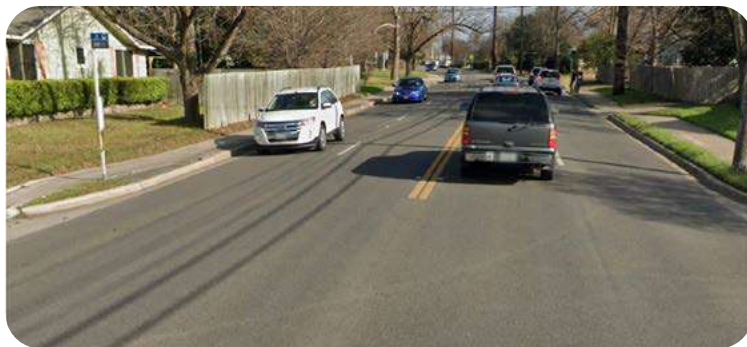
Allandale Road at Woodview Avenue

A pedestrian hybrid beacon signal at Woodview Avenue will allow transit users to safely cross Allandale Road to access transit.