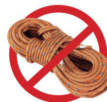
Rope & Cords