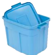
Totes and Lids