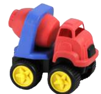
Toys (not battery operated)