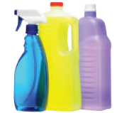
Cleaning Product Bottles