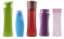
Soap and Shampoo Bottles