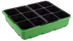
Flower Pots and Trays