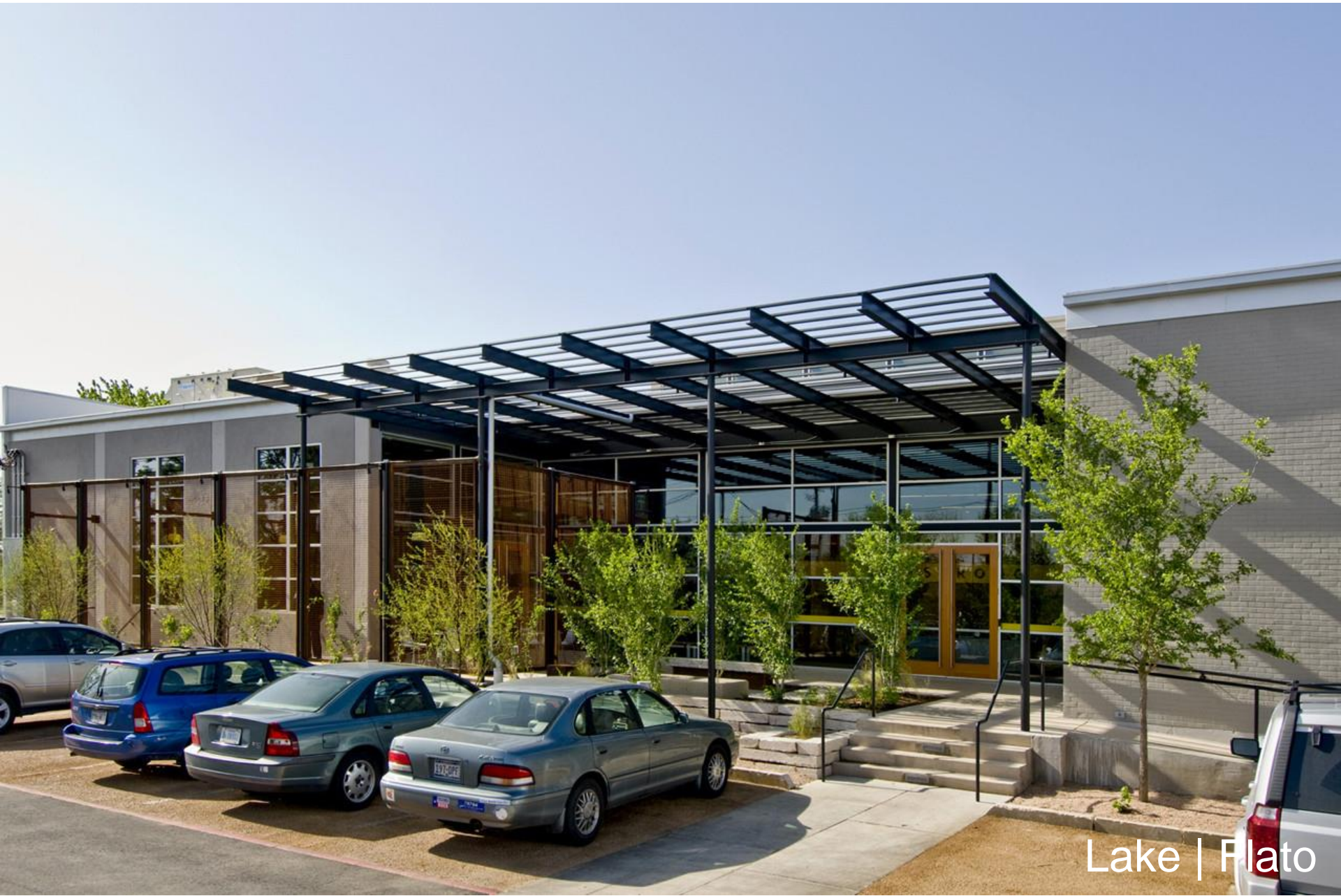
Lake | Plato