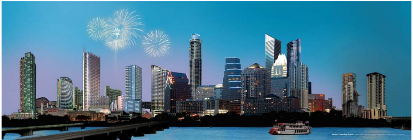
Austin Future

A Resource Guide Provided by the Greater Austin International Business Coalition