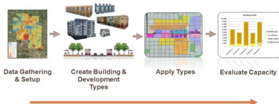
Figure 1. Envision Tomorrow Scenario Building Process

Envision Tomorrow is primarily a scenario planning tool, and in the CodeNEXT process, Envision Tomorrow was used to build and evaluate the capacity of the potential development patterns of Austin as proposed under the CodeNEXT draft code. The basic scenario building process is described below in Figure 1.