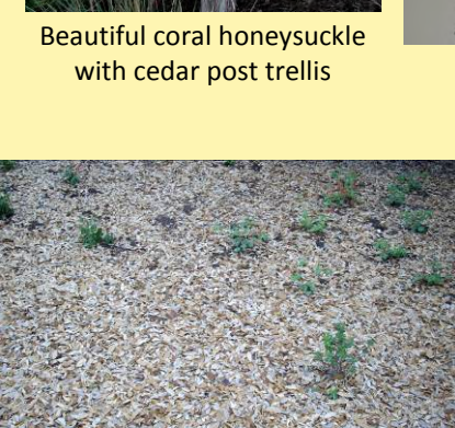
Lynn utilizes mulch provided by nature: live oak leaves!

Lynn: It's full of life, but at the same time very peaceful.