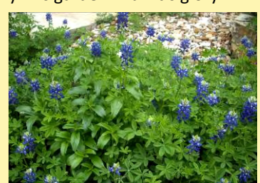
Lynn never planted a single bluebonnet, but the birds had other plans!