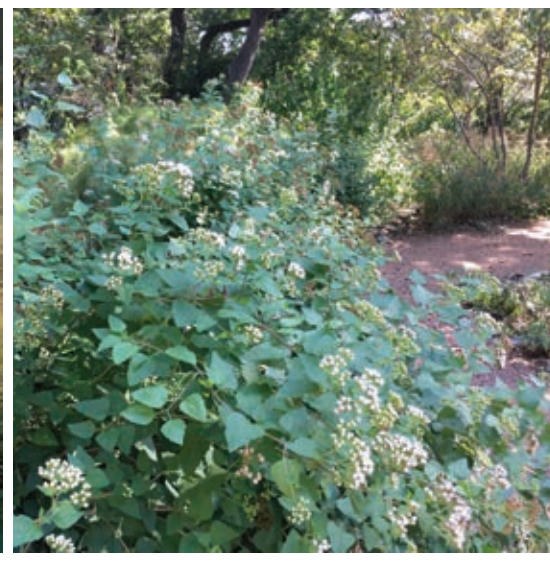
NATIVE GRASSES, FLOWERING PERENNIALS & SHRUBS | GRAMAS NATIVAS, PLANTAS DE FLORACION PERENNE Y ARBUSTOS