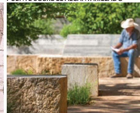
ALCANTARILLADO DE DESAGÜE