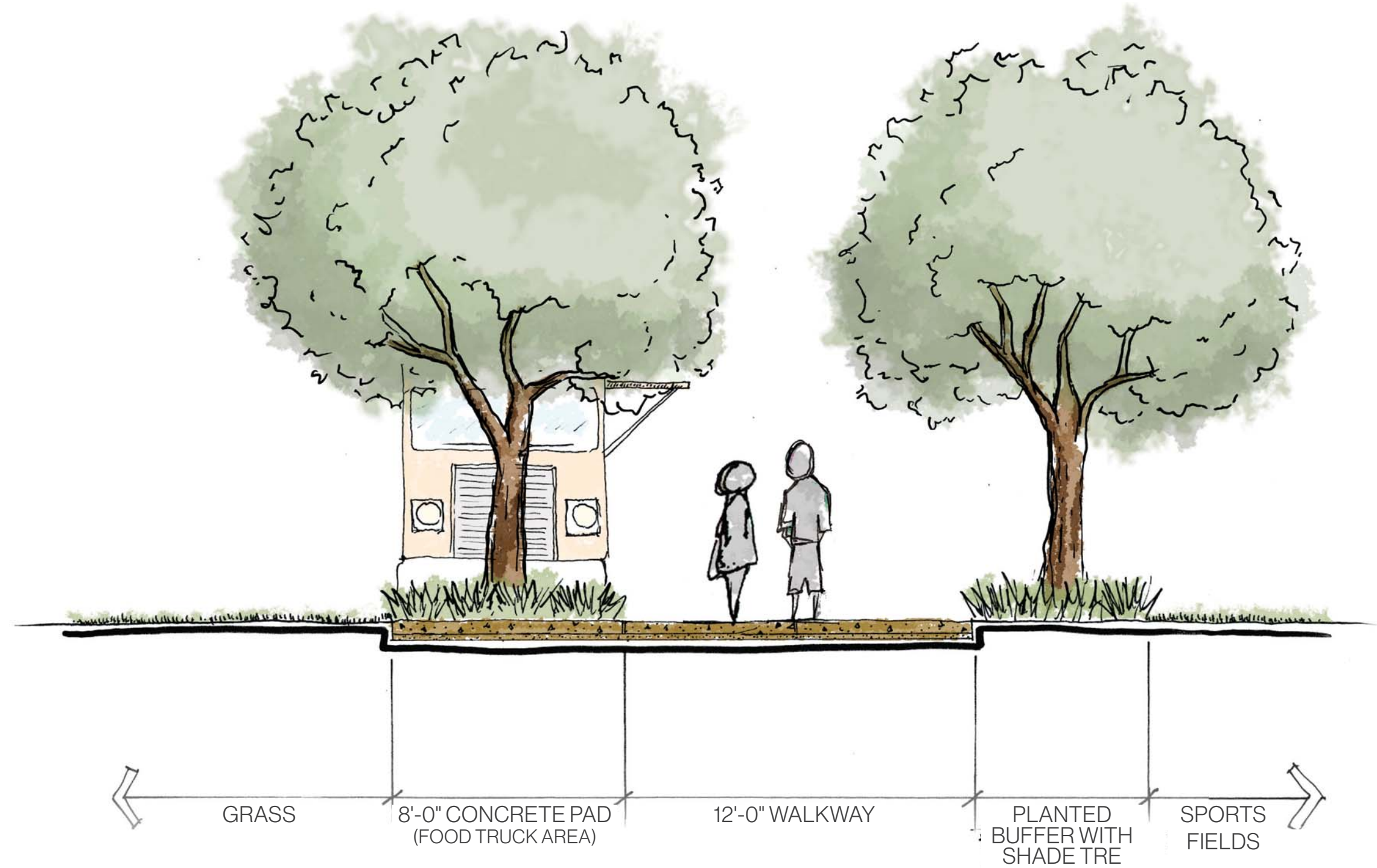
SECTION B | CENTRAL SPINE 1/4" = 1'-0"