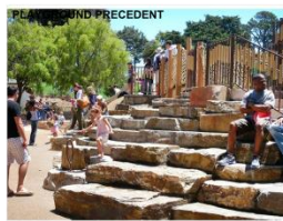
Lafayette Park San Francisco, CA Nature-Themed Play