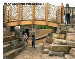
Lafayette Park San Francisco, CA Nature-Themed Play