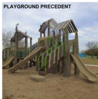
Dove Springs District Park Austin, TX Nature-Themed Play

Zilker Metropolitan Park has a 2-12 play structure, a 2-12 fire truck play structure, a 5-12 swing structure, a 2-5 swing structure, a phantom ship play area, and a musical stage play area. The 2015 play assessment performed by PARD safety team determined that the play equipment has outlived its useful life. The play equipment was installed in 1993 and replacement parts are difficult to find. The main play structure contains safety hazards, including the bridge that spans the Zilker Zypher track. The playground is in need of full replacement.