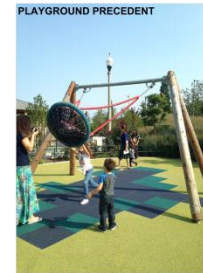
Maggie Daley Park Chicago, IL Modern Play