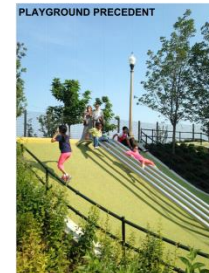
Maggie Daley Park Chicago, IL Modern Play