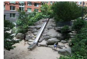
Tear Drop Park New York City Nature Based Play