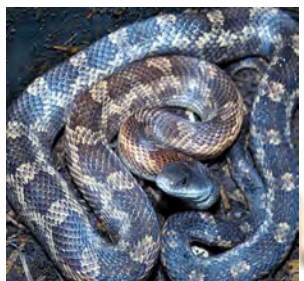
Texas Rat Snake: The only Austin-area native that climbs. This snake is a constrictor, and not venomous. They eat small mammals, such as rats and mice, and therefore compete with rattlesnakes for the same food sources, making them a beneficial reptile to have close to home!