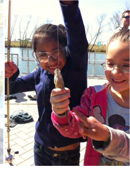
Dove Springs Rec Center children displaying their catch