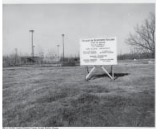
Butler softball stadium

September 11, 1950: " Dedication of new Butler softball stadium , built jointly by the Junior Chamber of Commerce and the Recreation Department bond funds. The grandstands have a seating capacity of approximately 3,500 and cost in the neighborhood of $20,000. During dedication week, the ASA World Softball Tournament was played on Butler #1 and #2 and had 25,000 spectators. The Clearwater Bombers from Florida won the World Championship."