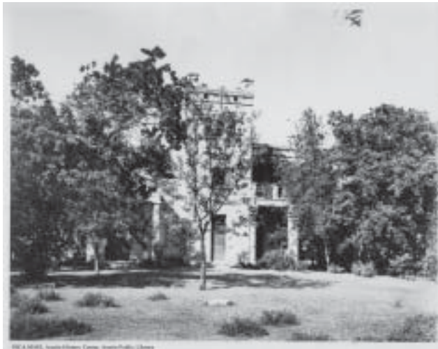
Elisabet Ney Museum,

January 1, 1942: "The Elisabet Ney Museum , which had been deeded to the City of Austin in September of the previous year, was placed under the administration of the Recreation Department." (1942 Annual Report).