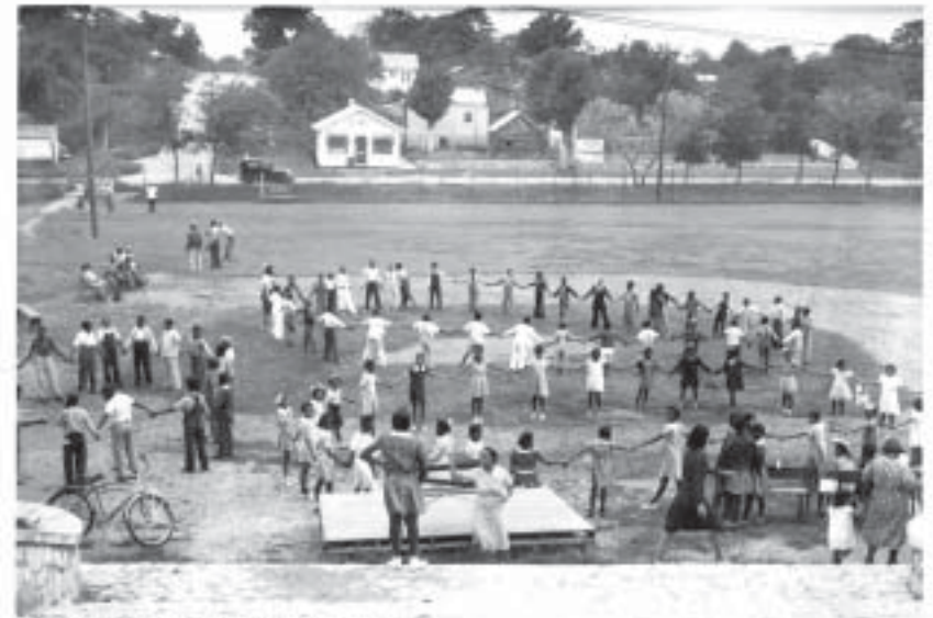
Juneteenth celebration at Rosewood Park

1930: "Soon after the $750,000 bonds were voted for Parks, Playgrounds, and Boulevards, an ordinance was passed creating a Parks and Playgrounds Commission to act in an advisory capacity to the City Council and the City Manager in the acquiring, developing, equipping and improving of all parks, playgrounds and boulevards owned and controlled by the City of Austin. Over 100 acres of land have been acquired, quite a substantial amount of which has been improved and beautified; nine playgrounds built and equipped and land for part of the Waller Creek Boulevard acquired and a portion of same is graded preparatory to paving. The boulevarding and beautifying of Shoal Creek is well under way – however, this project has been delayed on account of being unable to purchase some of the land but this the commission hopes to secure at an early date" (1930 City of Austin Annual Report).