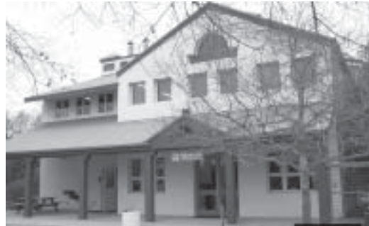
Austin Nature and Science Center

1982: "Opening its doors in 1982, the new Austin Nature Center and Annex (formerly known as the Natural Science Center) offers educational programs for children in areas of plants, birds, reptiles, fish, insects, and small mammals." (1981-1982 Annual Report).