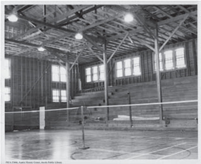
Austin Athletic Club (Austin Recreation Center)

July 1, 1931: "The Austin Athletic Club opens with 20 paid members. Membership fee is $1."