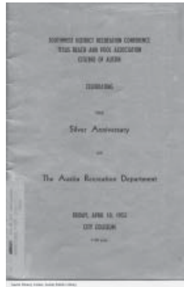
25 th Anniversary of the Austin Recreation Department

February 2, 1953: "A USO Certificate of Merit was received by the Director in behalf of the department for the work at Rosewood ."