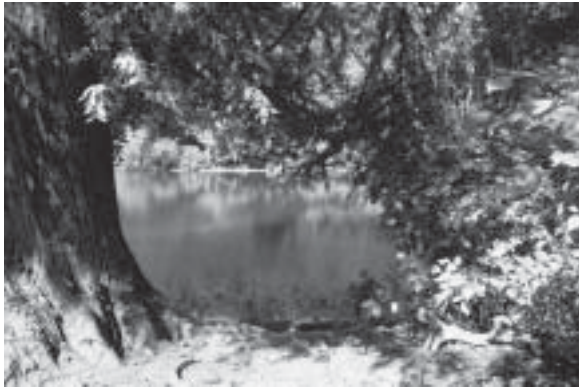
Red Bud Isle

1945: "Through an increased consciousness in the minds of the Austin School Officials and the public in general that the use of public school facilities should be extended to all people in the community, the recreation department was able to capitalize on such opinion and start programs at Baker and Fulmore Schools. (1945 Annual Report).