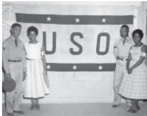
USO dance at Rosewood Park

March 20, 1945: "The Austin Symphony Orchestra played before the largest audience of its history, when, on March 20, it was presented, with Marian Anderson as guest soloist, by the University Cultural Committee in Gregory Gymnasium. A crowd of approximately 6,000 heard the orchestra as it accompanied the famous guest contralto and also played a regular concert."