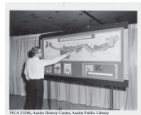
Town Lake Development Program

May 13, 1968: "With Mayor Akin cutting the green ribbon, the $20,000 complex of animal cages at the Natural Science Center were dedicated Monday as other city officials, Congressman Jake Pickle, Austin business representatives and members of the Austin Natural Science Association and the Junior League of Austin watched. The new structure will allow the animal exhibit to be open to the public for the first time."