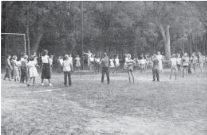
1954-55 East Woods Playground

April 1954: "Fourteen white playgrounds and three colored playgrounds were opened for the Spring season, with supervised activities from 5 to 9 p.m., Monday through Friday. This is the first year the colored playgrounds have been included in the Spring Program." (1954-55 Annual Report).