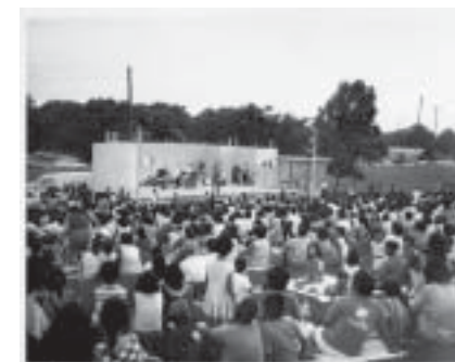
Pan Am Hillside Theater