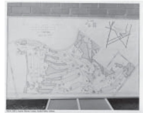
Morris Williams Golf Course

September 1962: "Two major decisions affecting the department were made by the City Council during September, namely, the "go ahead" for construction of a golf course to be located on airport property south of Manor Road (across from the airport) and approval of a garden center building in Zilker Park . The center will be located in a proposed municipal garden area."