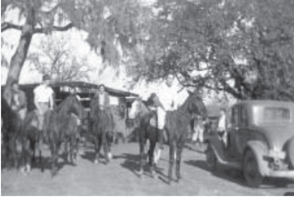
Barton Springs Riding Stable