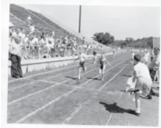
Track and Field Program

April 13, 1969: "The Isamu Taniguchi Oriental Garden was officially dedicated Sunday, April 13, after 18 months of voluntary labor by the designer, Taniguchi. Special invited guests were Aroa Ohta, Consul General of Japan and a party of 15 leading industrialists and government officials from Japan who were in the Southern United States on an economic mission. Mayor Harry Akin cut the ribbon to the 3-acre garden of winding flagstone paths, waterfalls, man-made mountains, and pools designed to spell out the word Austin."