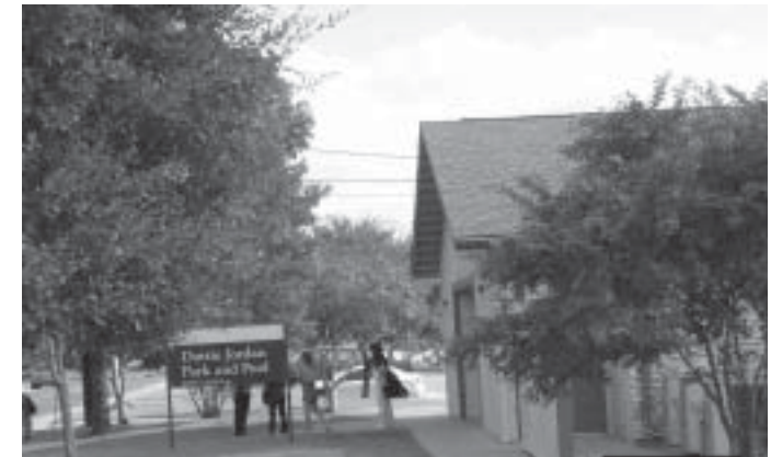
Dottie Jordan Recreation Center and Park

February 7-8, 1970: "Various sports activities were the center of attention at Rosewood Recreation Center with the annual George Mabson Tournament held February 7-8. Over 175 men and boys participated. The Austin Eastside team finished first, followed by Ft. Worth and Houston respectively."