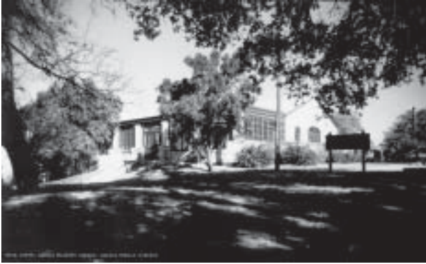
Hancock Recreation Center

American teams, and ten girls withdrew from the girls' program because of racial prejudice."