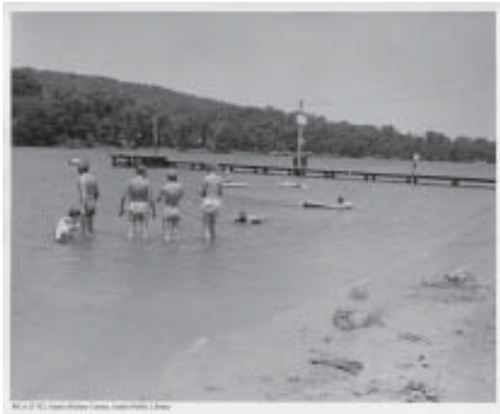
City Park on Lake Austin (Emma Long Metropolitan Park)

December 1939: "Plans are finalized for Austin's second metropolitan park, Lake Austin , with miles of shore line, a bathing beach and boat docks and 1,008 acres of land."