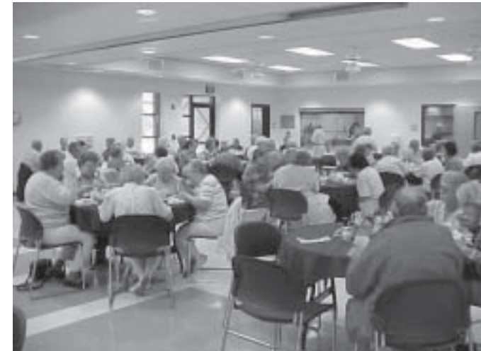
Senior Luncheon Program

March 1973: "The highlight of the 1973-74 Senior Citizens Program was the start of the Austin-Travis County Senior Luncheon Program . The project funded by Title VII of the Older Americans Act, provides a hot, noon meal for 345 elderly people, five days a week. Another project of the senior program, the Community Workshop Market , involved 400 seniors in arts and crafts classes. Located in Mayfield Center, the market and workshop had six sales throughout the year which benefited the senior citizens." (1972-73 1973-74 Annual Report).