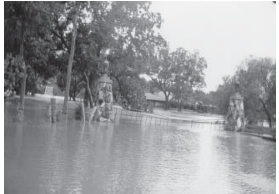
Flooded Barton Springs Pool

July 1935: " Barton Springs pool is closed from June 11 to July 4 due to flooding in Barton Creek and back waters from the Colorado River, leaving a deposit of 1 ½ ft. of leaf-mold, mud, silt, and debris on the grounds and in the swimming pool."