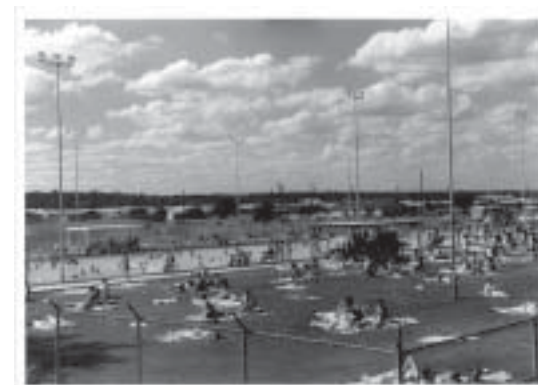
Northwest Park Swimming Pool

July 28-29, 1956: "Austin newest municipal swimming pool in Northwest Park was initiated the week-end of July 28-29 with the South Texas Amateur Athletic Union Swimming and Diving Championships."