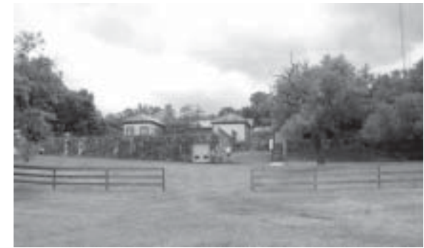
Commons Ford Ranch Metropolitan Park

1982: "Land acquisitions continued throughout the year. The most notable tract acquired was the 215 acre Commons Ford Ranch Metropolitan Park ." (1982-1983 Annual Report).