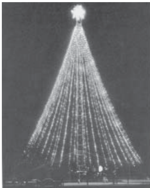
World's Tallest Christmas Tree, Zilker Tree