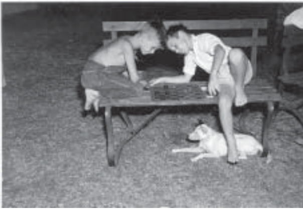
Boys playing checkers in park in 1938

August 9 & 10, 1935: Fourteen teams entered the State Women's T.A.A.F. Softball Meet held here, August 9 and 10. Austin Ice of Austin won the state title. (1935 Annual Report).