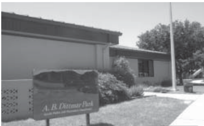
Dittmar Recreation Center

1986: "During the 1981 Memorial Day floods, the Austin Recreation Center sustained an enormous amount of damage. As a result of this damage, a new Austin Recreation Center was built across the parking lot from the old building. The center, now located at 1301 Shoal Creek Blvd., opened in 1986."