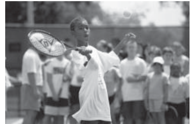
National Junior Tennis League