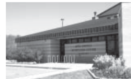
Dove Springs Recreation Center

1997-98: "The first annual Adopt-A-Park awards luncheon honored those who increased community support for Parks and Recreation during fiscal year 1997-98. More than $2,595,800 and 62,820 hours of volunteer time has been generated by Adopt-A-Park. Of the funding, $2,375,636 came from in-kind contributions and $220,232 was raised in cash donations. The volunteer hours were contributed by 4,980 volunteers." (1997-98 Annual Report).