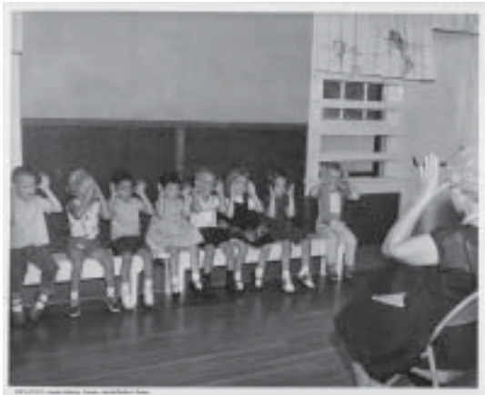
Tiny Tot program

December 1961: "Muny Pro Shop gets complete "Face Lifting". From a new west entrance, the entire lobby will have a new look for golfers entering Municipal in 1962.