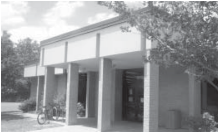
South Austin Recreation Center

September 5, 1974: "The South Austin Recreation Center was completed and the official dedication was held on September 5, 1974, with an initial cost of the new center totaling $430,000". (1981-1982 Annual Report).