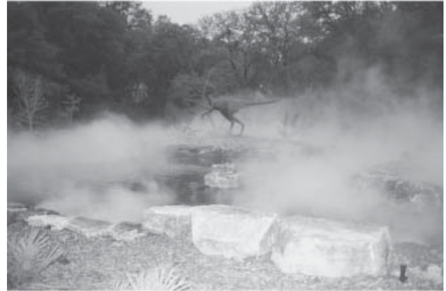
Hartman Prehistoric Garden

March 22, 2002: "The groundbreaking ceremony for the Dino Pit was held on March 22 nd . This exhibit was designed to teach participants of all ages about the field of paleontology through hands-on educational activities. The development of this exhibit was a collaborative effort of the Austin Nature and Science Center and the Texas Memorial Museum of Science and History at the University of Texas." (2002 Annual Report).