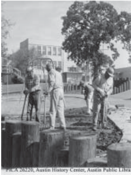
Zilker Park Playscape

August 1970: "The new Zilker Play-Scape officially opened at ceremonies held in August, attended by Congressman J. J. "Jake" Pickle, city dignitaries and member of the Austin Lions Club. The play area adjacent to Barton Springs now features a covered shelter area with a capacity of up to 50 persons, a space platform, an antique fire engine and a