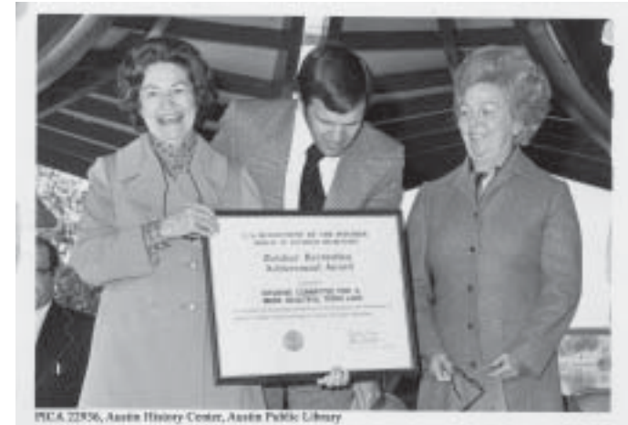
Mrs. Lyndon Johnson

1977-78: "The Austin Parks and Recreation Department has enjoyed an outstanding reputation since it was first established in 1928 and 1977-78 was a fitting year for the celebration of the department's 50 th Anniversary . Many services were extended this past year with the completion of new facilities such as the Mary Ireland Graves Dougherty Cultural Arts Center , new swimming