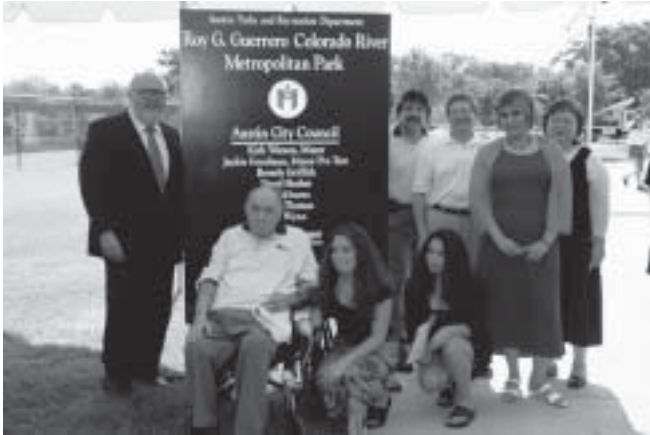
Roy G. Guerrero Colorado River Metropolitan Park Dedication