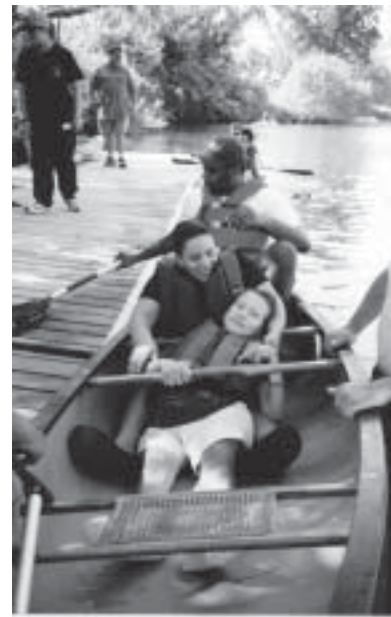
Rock the Boat