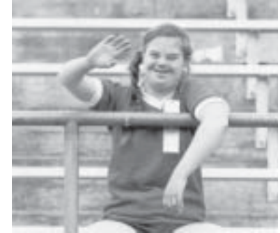
Danny G. McBeth Recreation Center participant

June 1982: " Danny G. McBeth Recreation Center is a totally accessible facility. The recreation center, located in Zilker Park, was purchased from the Knight of Columbus in 1981. The Parks and Recreation Department officially took possession of the center in June, 1982." (1982-1983 Annual Report).