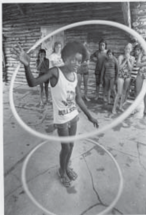
PICA 11195, Austin History Center, Austin Public Library