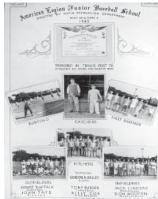
1945 American Legion Jr. Baseball School