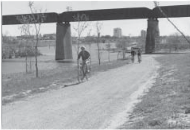
Town Lake Hike and Bike Trail

officials and other dignitaries were on hand to run the first shovel of earth. Construction of the $36,000 Gazebo will begin immediately."