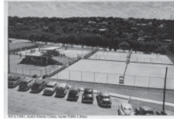
Caswell Tennis Center