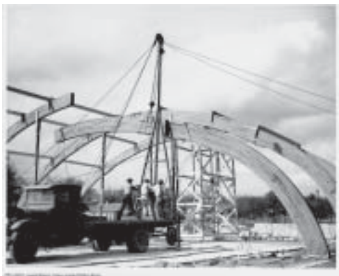
Doris Miller Auditorium under construction