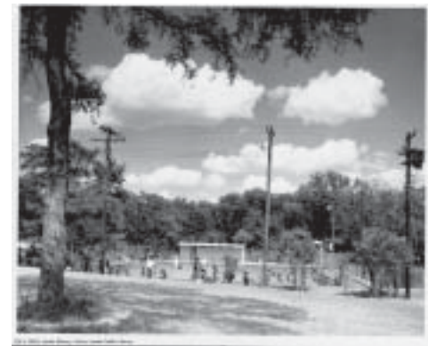
Rosewood Swimming Pool

May 1, 1944: "The Rosewood Swimming Pool , which is operated for the Colored people, was officially opened on Monday, May 1, with a large crowd on hand throughout the day."