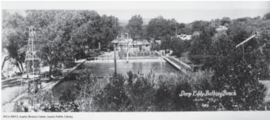
Deep Eddy Pool

March 1936: "This is the first year that Life Guard Training becomes a requirement for employment."