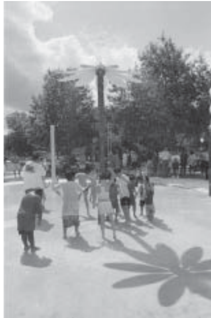
Metz Water Playground

September 8, 2002: "The 18 th . Annual " Rock the Boat " was held at Fiesta Gardens . This canoe and kayak event is held each year to give individuals with special needs an opportunity to participate in boating experiences in a safe environment." (2002 Annual Report).