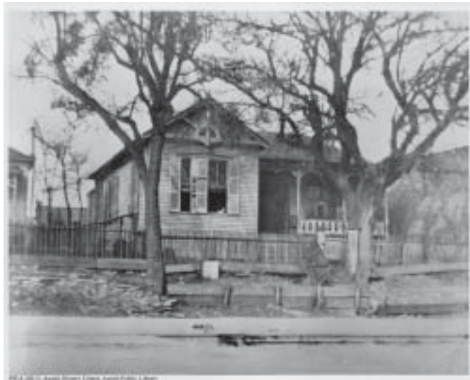
O'Henry Home (later O'Henry Museum)

January 1934: "For the first time in the history of Austin Playgrounds , activities will start in January. We hope to convince everyone of the necessity and importance of having the playgrounds open the year round and that the Recreation Project submitted to the C.W.A. Board was a very worth while proposition. At present, we have 47 people employed on the playground project. Others are to be added to this group soon."