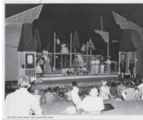
Zilker Hillside Theater

August 3, 1959: "The first day of operation in the new office building for the Recreation Department was Monday, August 3. Every inch of the 3,868 square feet of the office is being enjoyed and used by the staff to increase the efficiency of the Department's operation. The department has been "at home" in six varied environments prior to the recent move into this "home for keeps". In the late 1920s, when the Department was first established, it was lodged in the City Hall. From there, it finally migrated to 1500 W. Riverside Drive via the Library, the Municipal Building, the Dahlich Building, the Library again, and 1624 Barton Springs Road."