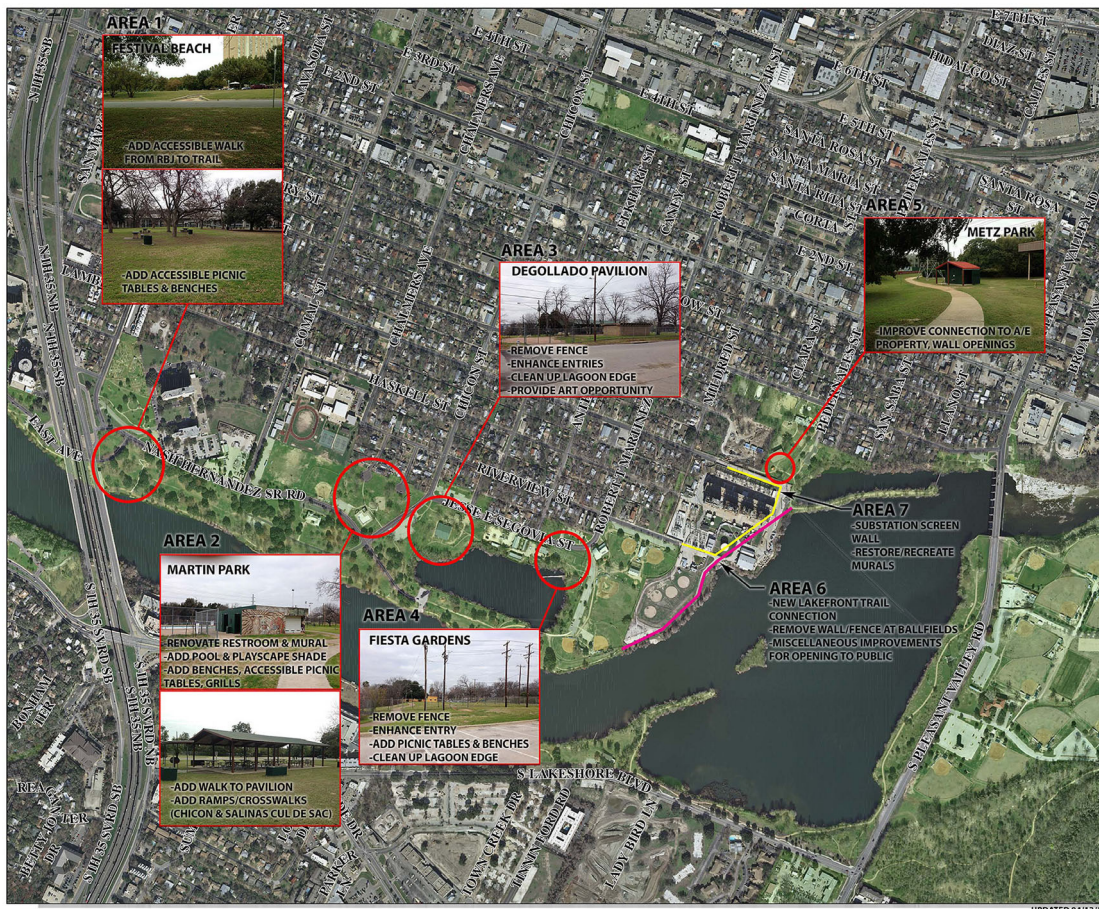
Holly Shores/Edward Rendon Sr. at Festival Beach Master Plan Phase 1A Implementation: Study Areas/Potential Improvements