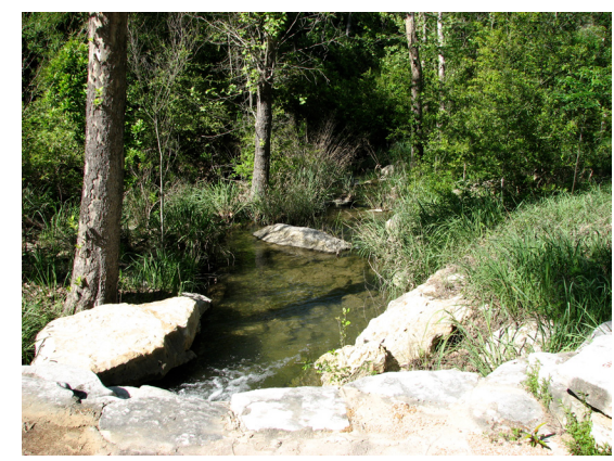
A Hill Country stream to which local limestone boulders and native vegetation have been added. An example of how a comparatively denuded riparian landscape can be enhanced.