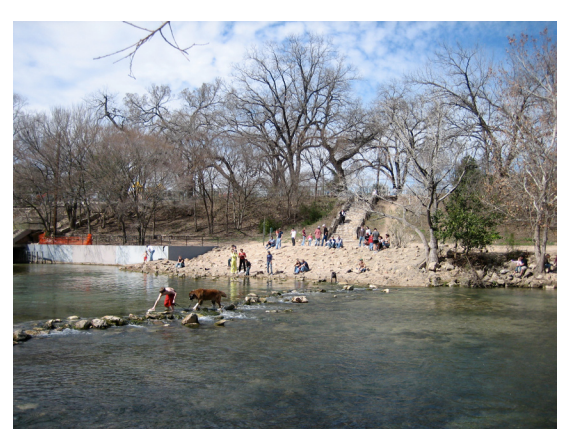
Remove existing concrete slab and redesign with new stonework for greater comfort and natural beauty. Add new weathered limestone paving at terrace below stairs. Rehabilitate existing stone stair for safer footing and add handrail.