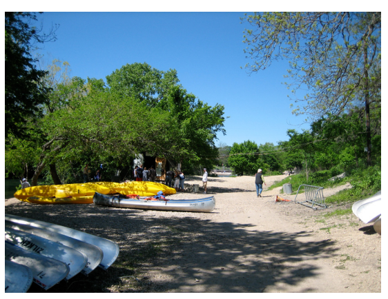
Define a particular dimension to this gravel path using stone edging and the occasional boulder. Revegetate areas outside path with native plants.