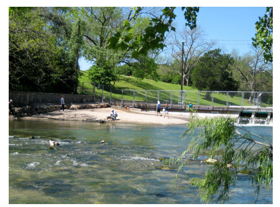
Remove existing concrete and redesign with new stonework for greater comfort and more natural beauty. Using water spilling over the dam, integrate flow into the design to create an attractive "fish ladder" effect.