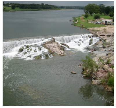
The spilling water effect may bear some resemblance to this Llano River example.

Build a viewing area immediately across the creek from the outfall. This area should include interpretative materials to explain the event and its relationship to its larger natural context.