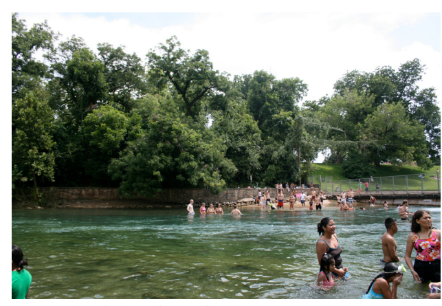
"Dog Park", a lively and enjoyable scene.

Develop the area on the north bank, just below the dam, into an overlook Consider additional hardscape on the north side of the creek, atop the retaining wall between the steps and the dam. The soil level in this area is lower than the retaining wall,