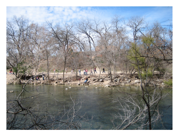
Reestablish diverse forest along slope of creek bank.