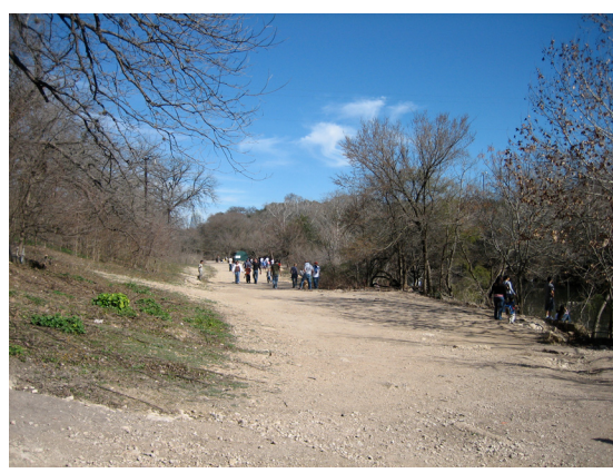
Define a particular dimension to this gravel path using stone edging and the occasional boulder. Revegetate areas outside path with native plants.