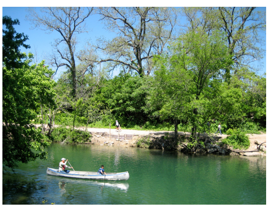
Restore riparian vegetation along creek edge, intermingle with boulder groupings.