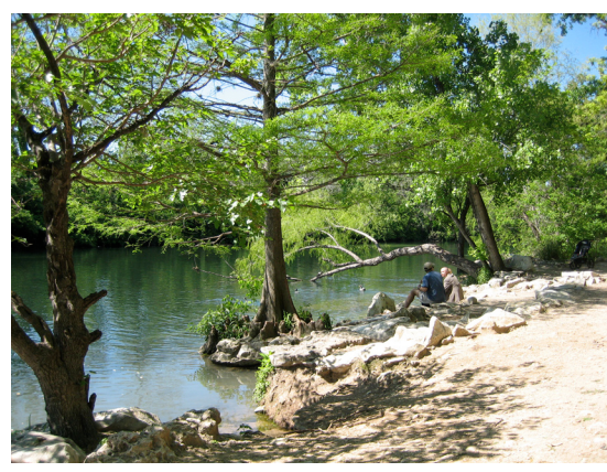
Restore riparian vegetation along creek edge, intermingle with boulder groupings.

introduced. Good choices for shade trees, in addition to the sycamore and cypress, would be cedar elm, Western soapberry and Texas Ash. For smaller, understory trees, planted in groves of 5 or more of a single variety, good choices include Mexican plum, Texas redbud, yaupon holly and Eve's necklace. There is not a functioning irrigation system in this area, but for creekside plantings, the water table may be sufficiently high that fall and winter tree plantings would be successful without additional water. For planting on the slope between the train tracks and the lower trail, locate a hose bib or quick coupler within 100 feet of any additional planting, so that hose end irrigation on a timer can be used to establish new trees.