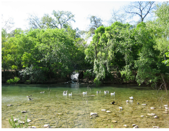
Create an overlook to highlight the waterfall spilling from the Sunken Garden spring run.