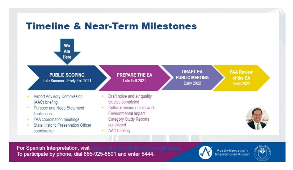
*Picture of presentation slide from Virtual Scoping Meeting on Thursday, September 9, 2021