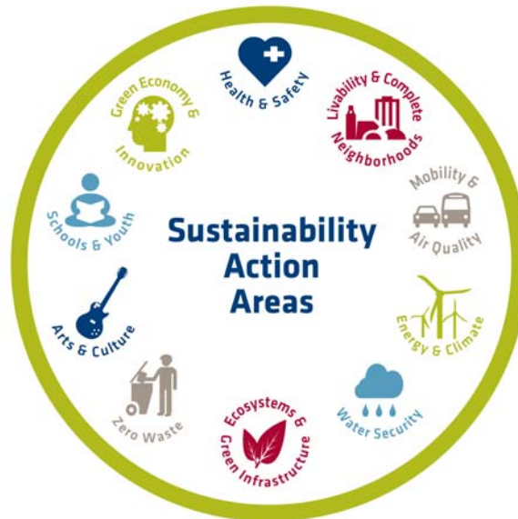
Exhibit 4.7: Sustainability Action Areas

The concept of sustainability is not new to NHCD. Energy efficiency, green building, and transit-oriented housing initiatives have long been incorporated into the spectrum of NHCD's housing activities, and low- and moderate-income households have for years enjoyed benefits of such efforts, including lower utility bills, healthier home environments, increased mobility and reduced transportation costs. With the advent of the City's Sustainability Office, NHCD is committed to building upon previous efforts to improve and further refine NHCD's business models to achieve sustainability outcomes. NHCD is dedicated to being a local and national green business leader in the fields of affordable housing and community development. This section provides descriptions of initiatives that promote the City's sustainability balance.