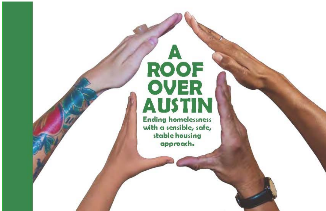
Exhibit 4.3 Roof Over Austin