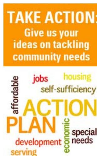
Exhibit 4.5 FY 2012-13 Action Plan

NHCD's Planning, Policy and Outreach staff worked closely with the City's Corporate Public Information Office to develop an extensive community engagement and outreach strategy with the intent to increase awareness of the community needs assessment period, gain interest and increase public participation. The collaborative efforts of NHCD and CPIO resulted in the development of a FY 2012-13 Action Plan web site, an online survey for the public to rank their priorities, the design and implementation of various marketing and promotional materials highlighting ways to participate. The theme for the community needs assessment period was, "6 Ways to Take Action" - which provided a variety of channels for the community to participate. For more information on the community needs assessment period and NHCD's "6 Ways to Take Action" flyer, visit Chapter 1. Exhibit 4.5 displays the logo used to launce the City's FY 2012-13 Action Plan process.