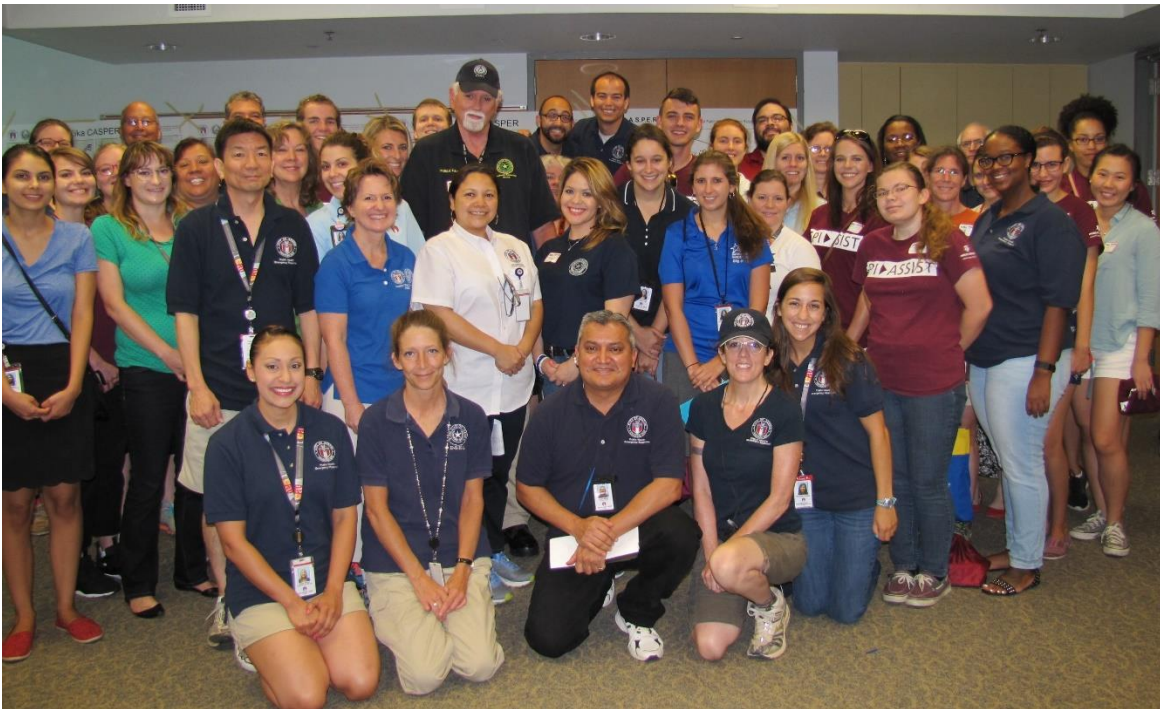
Zika virus Disease, Austin/Travis County –June 17 –18, 2016