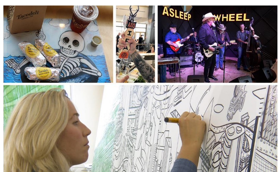
2019 Airport Fun Facts - Keeping It Local

Austin-Bergstrom International Airport (AUS®), is the airport of choice for Central Texas, flying to over 63 destinations with 17 carriers. Currently experiencing an almost 10% annual growth in PAX, it is the 2<sup>nd</sup> fastest growing airport in the U.S. AUS® is owned and operated by the City of Austin, through its Department of Aviation.