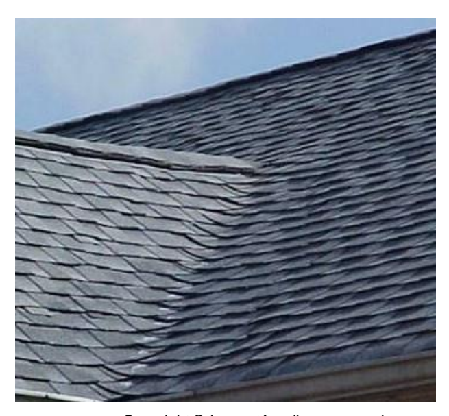
Copyright 2023 © Carson Dunlop, www.carsondunlop.com