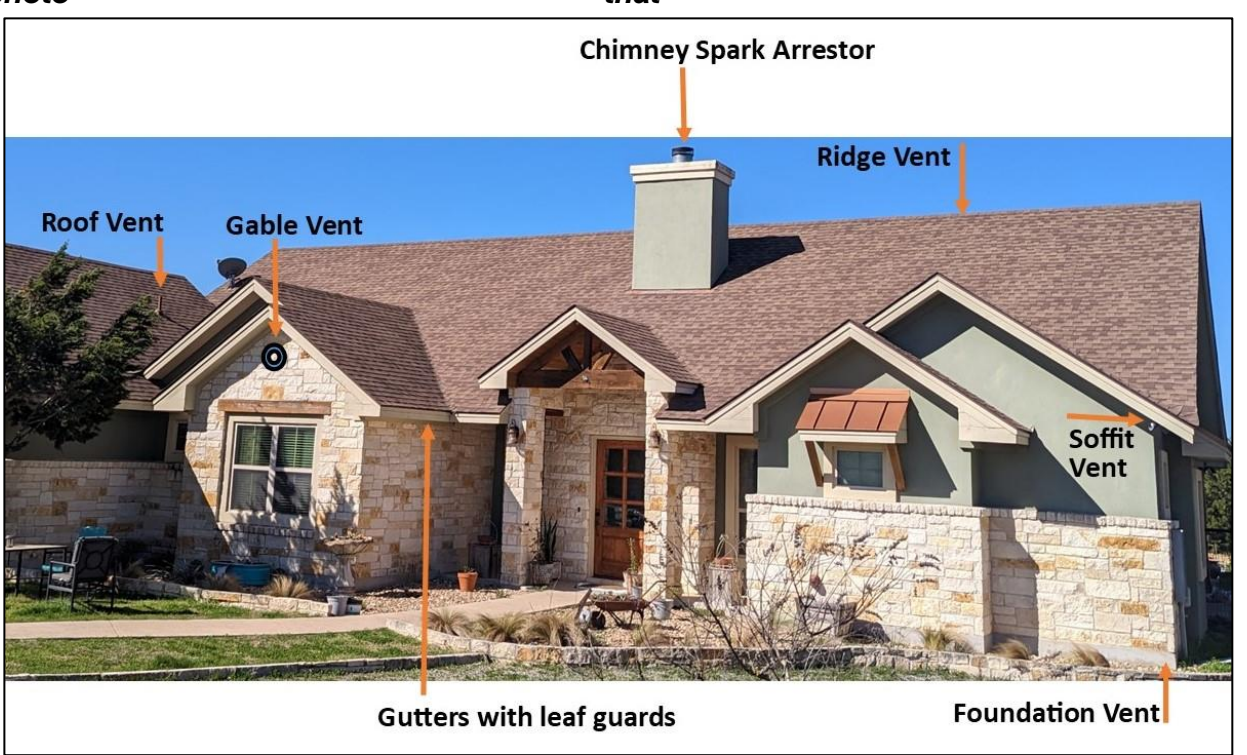
illustrates the proper items discussed herein.