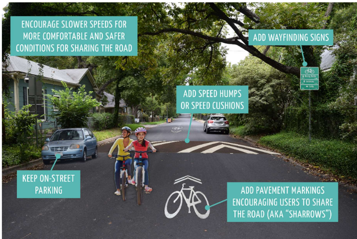
Concept for a neighborhood bikeway / Ciclovías del vecindario

Las ciclovías del vecindario son calles con velocidades y volúmenes de tráfico de vehículos de motor más bajos donde la seguridad y la comodidad de las personas que andan en bicicleta, caminan y juegan en la calle es una prioridad. Los proyectos de ciclovías del vecindario pueden incluir marcas en el pavimento para alertar a las personas que conducen que deben esperar gente andando en bicicleta, intersecciones mejoradas de las calles principales, señales para guiar gente en bicicleta a destinos locales y regionales, y herramientas de reducción de velocidad (como topes o reductores de velocidad). El proyecto propuesto incluye cambios en Rio Grande Street, W 30 th Street, W 31 st Street, Shoal Creek Boulevard, West Avenue, W 40 th Street, Burnet Road, W 41 st Street, West Drive, East Drive, Hemphill Park, W 33 rd Street, and W 34 th Street. Un diseño preliminar estará disponible en la reunión pública del proyecto el jueves 12 de marzo de 6:30 a 7:30 p.m. para que lo revise y envíe sus comentarios. Favor de contactar Sophia Benner para preguntas, comentarios, o traducción de materiales de proyectos en línea al 512-974-7853 o sophia.benner@austintexas.gov . El periodo para comentarios estará abierto hasta domingo el 1 de marzo de 2020. Visite el sitio web del proyecto para más información: austintexas.gov/NUHR-Bikeways