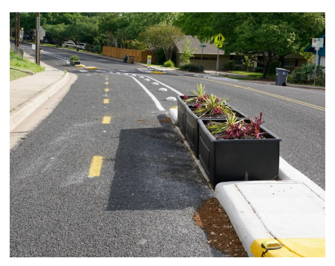
Example of pedestrian crossing islands and a two-way protected bikeway constructed using concrete traffic buttons and planters on Barton Hills Drive

A preliminary design will be available at the project open house for you to review and provide feedback. We look forward to seeing you at the project open house on Thursday, January 23, or hearing from you through the project survey. The survey and open house materials will be available online starting on January 23. The survey will be open through Sunday, February 23. Visit the project website for more information and updates: austintexas.gov/BluebonnetLn