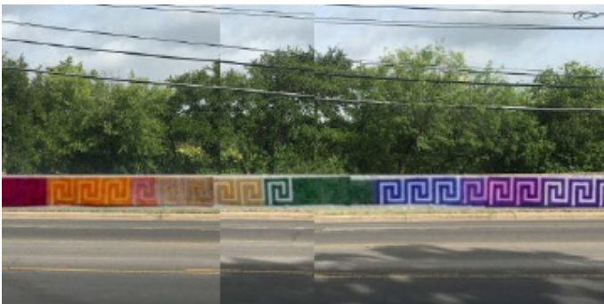
Flash Collective Meander

This abstract mural that complements both the natural and built environment. Its colors reflect the glass of downtown buildings and the waterfront of Town Lake, with shapes that represent minerals and stones—such as celestine and limestone—found in Central Texas.