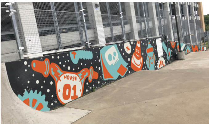
SHOWGOATMURALWORKS Locals Mostly

This colorful artwork will circumscribe a skylight located within the Austin Nature and Science Center. Imagery for the mural is drawn from a photography workshop with participants of the Center's youth summer programs.