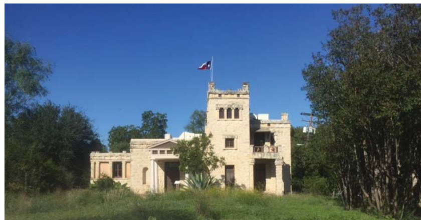
Elisabet Ney Museum