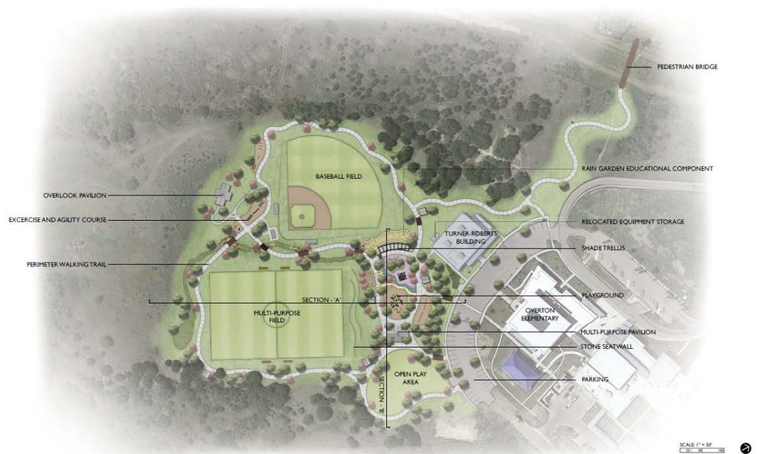
Colony Park District Park