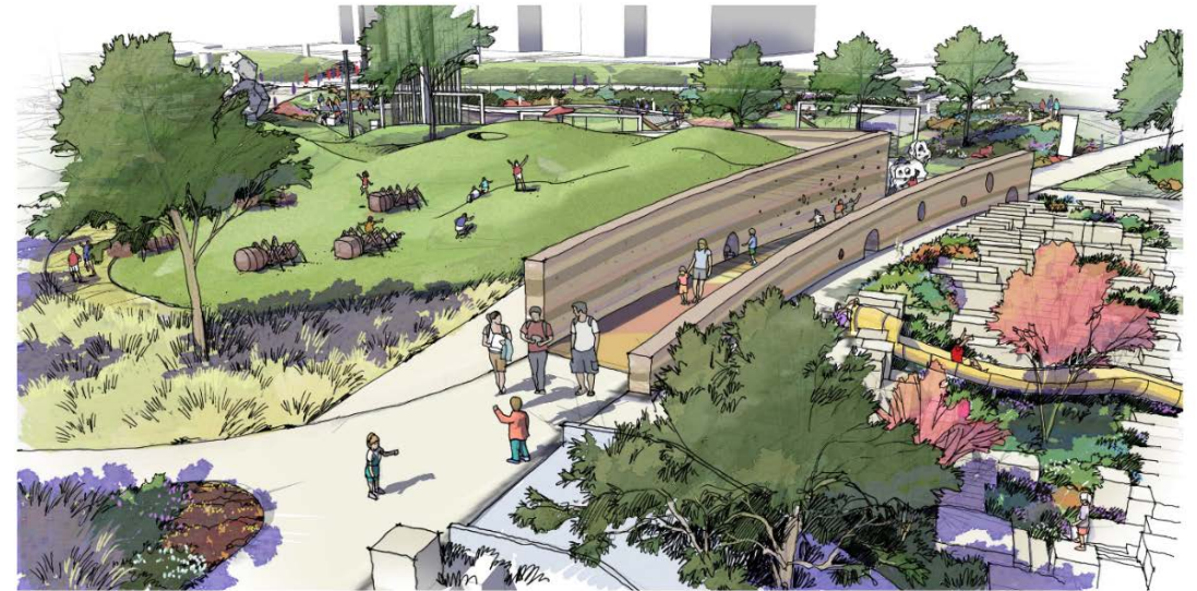
Alliance Children's Garden