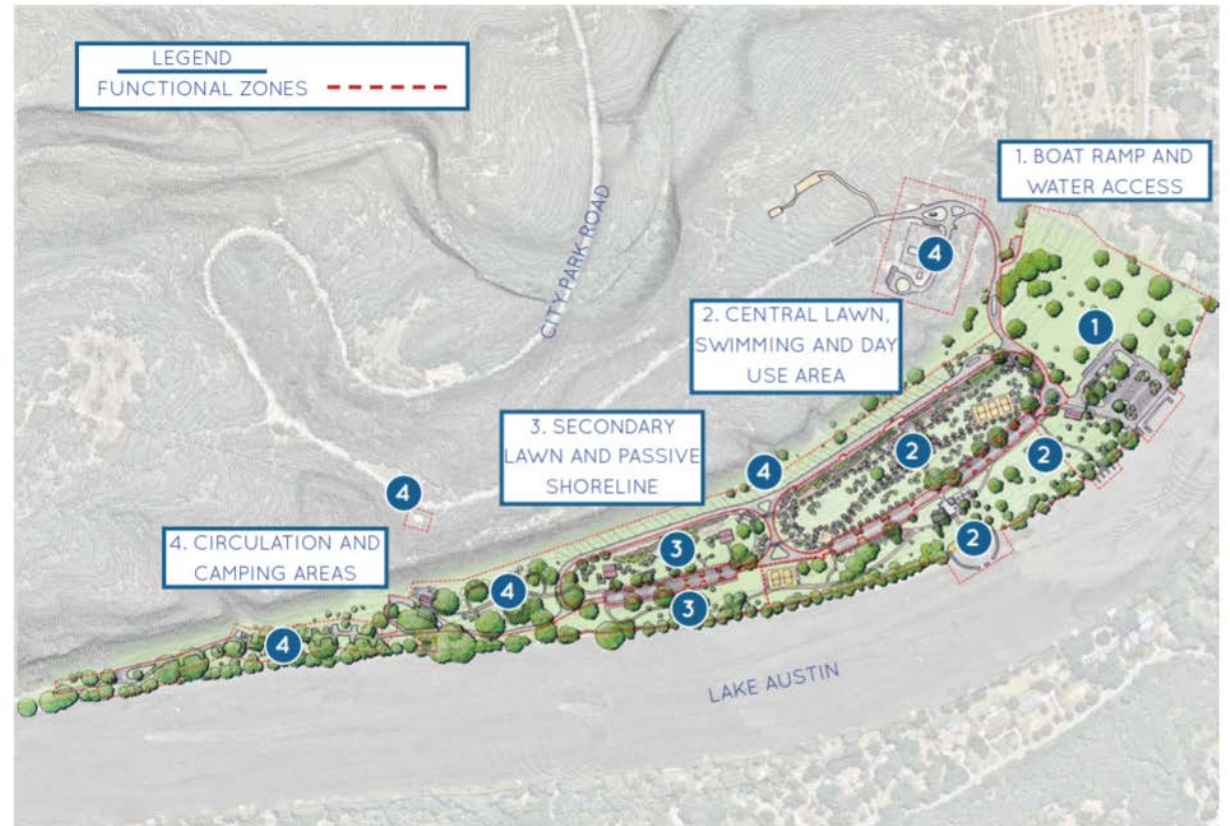
Emma Long Metro Park