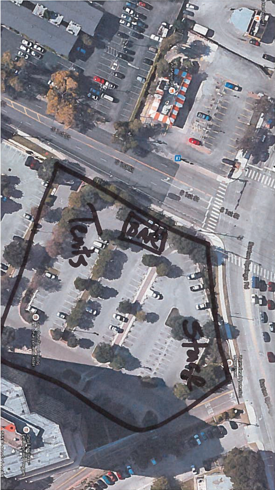
Google Maps 505 Barton Springs Rd