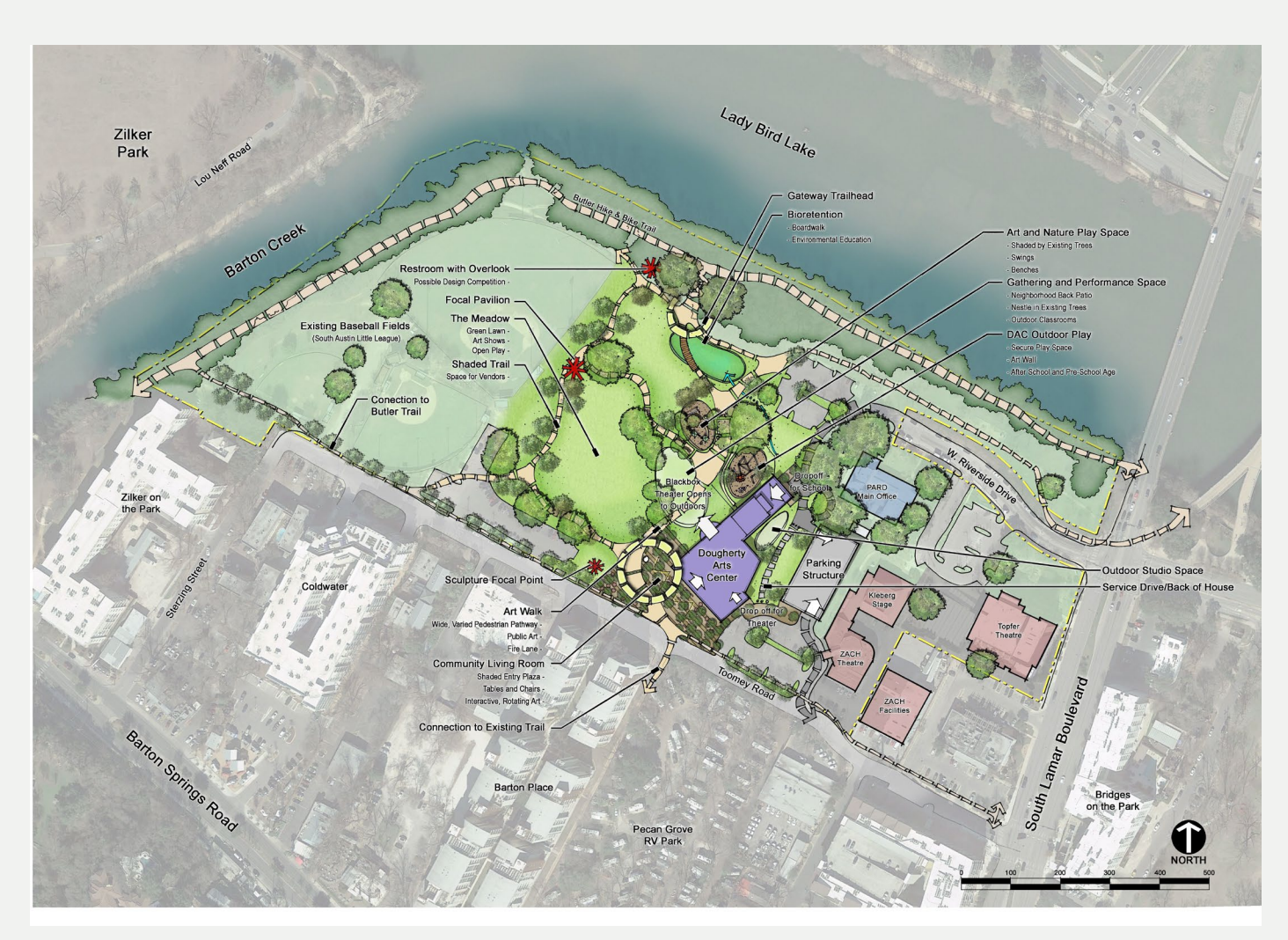
Conceptual Site Plan