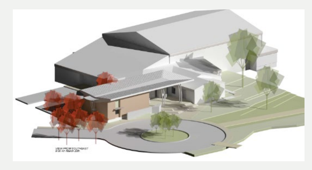
Dove Springs Recreation Center