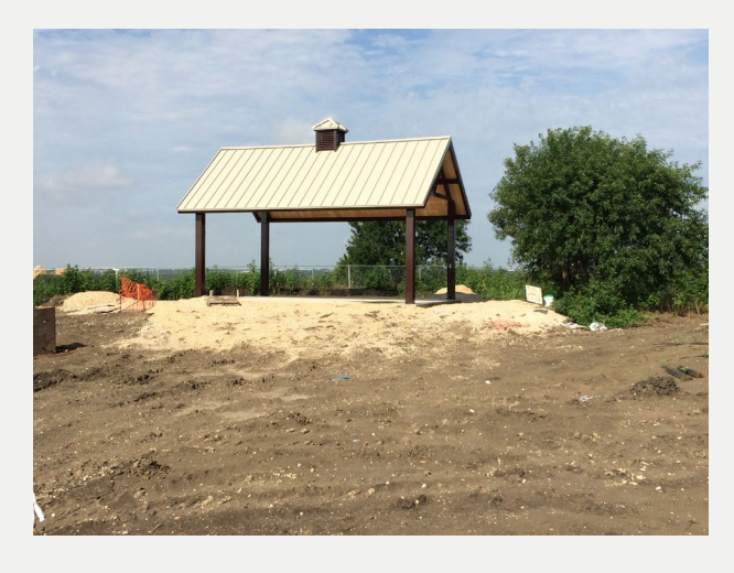
Colony Park Pavilion

☐ Total Funding Amount .... $170.5 Million